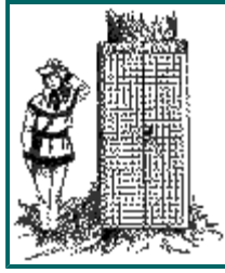
Fig. 241. A Bull's-Eye Hit

The bull's-eye in Fig. 241 counts seventeen, ten for horizontal and seven for vertical. A throw above or below the "0" on this target takes off from one to four points from the thrower's score, as is indicated by the minus signs on the target.