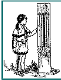
Fig. 240. A Tomahawk Target

For ordinary field work, make a target on a broad, two inch pine plank, and do it by marking the plank with chalk, or, better still, paint the board white and the stripes black, as in Fig. 240.