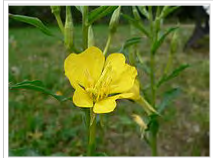
The evening primrose flower ( O. biennis ) produces an oil containing a high content of \gamma -linolenic acid, a type of omega-6 fatty acid.