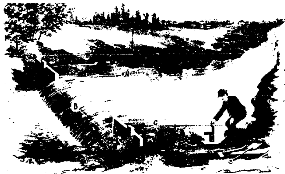
Measuring Flow of Water by Weir Method

After deciding upon suitable location for the new power plant, the following preliminary measurements must be obtained: