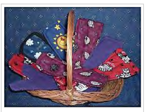
Basket of various cloth menstrual pads