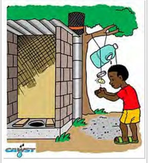
Poster used in Africa for raising awareness about handwashing after using the toilet with simple low-cost handwashing device