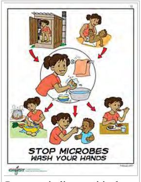
Poster to indicate critical times when hands should be washed to reduce spread of disease