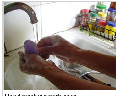
Hand washing with soap

Medical hand hygiene pertains to the hygiene practices related to the administration of medicine and medical care that prevents or minimizes disease and the spreading of disease. The main medical purpose of washing hands is to cleanse the hands of pathogens (including bacteria or viruses) and chemicals which can cause personal harm or disease. This is especially important for people who handle food or work in the medical field, but it is also an important practice for the general public.