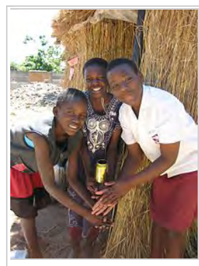
Students washing their hands with a simple handwasher at a school in Zimbabwe (Chisungu School in Epworth)

In 2005, in a study conducted by TÜV Produkt und Umwelt, different hand drying methods were evaluated.<sup>[33]</sup> The following changes in the bacterial count after drying the hands were observed: