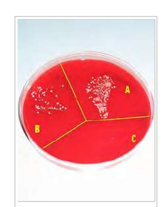
Microbial growth on a cultivation plate without procedures (A), after washing hands with soap (B) and after disinfection with alcohol (C).

The purpose of hand-washing in the health-care setting is to remove pathogenic microorganisms ("germs") and avoid transmitting them. The New England Journal of Medicine reports that a lack of hand-washing remains at unacceptable levels in most medical environments, with large numbers of doctors and nurses routinely forgetting to wash their hands before touching patients.