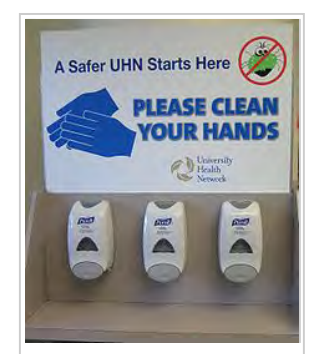
Hand cleaning station at the entrance of the Toronto General Hospital

Hand washing with soap is the single most effective and inexpensive way to prevent diarrhea and acute respiratory infections (ARI), as automatic behavior performed in homes, schools, and