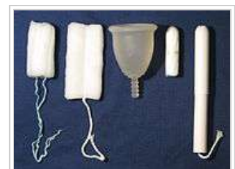
A large Fleurecup menstrual cup with capacity roughly 3 times greater than the absorbency of a large tampon

A 2011 randomized controlled trial in Canada investigated whether menstrual cups are a viable alternative to tampons and found that approximately 91% of women in the menstrual cup group said they would continue to use the cup and recommend it to others. [11] In a 1995 clinical study involving 51 women, 23 of the participants (45%) found menstrual cups to be an acceptable way of managing menstrual flow. [16] In clinical testing, after three cycles of Softcup use, 37% of subjects rated the Softcup as better than pads or tampons, 29% as worse than, and 34% as equal to pads or tampons. The 37% who preferred the Softcup attributed their preference to "comfort, dryness, and less odor." [10]