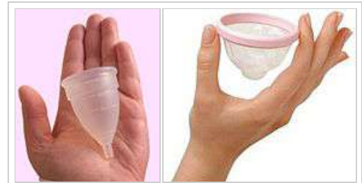
A bell-shaped brand of menstrual cup (left) which is about 2 inches (5.7 cm) long, not including the stem. A disposable Softcup (right) looks similar to a contraceptive diaphragm and is about 3 inches (7 cm) in diameter.

Manufacturers have different recommendations for when to replace the cups, but in general they can be reused for five years or so. Disposable menstrual cups are also available – these work in a similar way to regular menstrual cups except they are disposed of after every use or (for some brands) after every cycle.