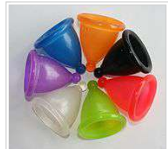
MeLuna Menstrual cups come in a wide variety of colors, stem styles, capacities and 'firmness' levels