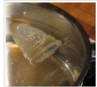
Boiling a menstrual cup