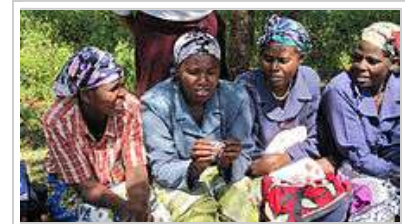
Women in Meru, Kenya examining a menstrual cup.