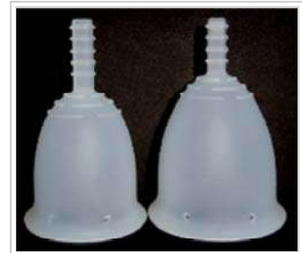
Fleurocup small size (left) and large size (right). The stem may be trimmed.

After about 4-12 hours of use (depending on the amount of flow), the cup is removed by reaching up to the stem of the cup in order to find the base. Simply pulling on the stem is not recommended to remove the cup, as pulling it down will create suction. The base of the cup is pinched to release the seal, and the cup is removed. After emptying, the cup should be rinsed or wiped and reinserted. It can be washed with a mild soap, and sterilized in boiling water for a few minutes at the end of the cycle. Alternatively, sterilizing solutions (usually developed for baby bottles and breast pump equipment) may be used to soak the cup. Specific cleaning instructions vary by menstrual cup.