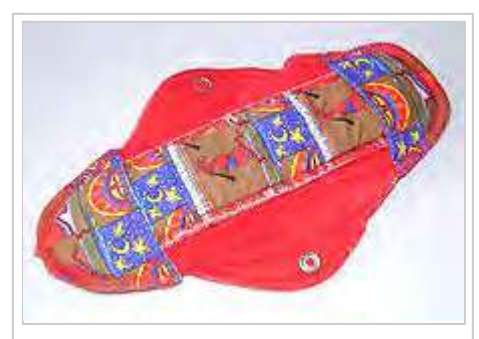
Reusable cloth menstrual pad with Kokopelli motif.

Alternatively, some women use a washable or reusable cloth menstrual pad. These are made from a number of types of fabric — most often cotton flannel, or hemp (which is highly absorbent and not as bulky as cotton). Most styles have wings that secure around the underpants, but some are just held in place (without wings) between the body and the