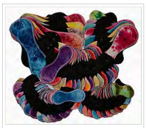
Modern reusable cloth pads in differing sizes

Menstrual pads are worn to absorb menstrual discharge (and thereby protect clothing and furnishings). They are usually individually wrapped so they are easier and more discreet to carry in a purse or bag. This wrapper may be used to wrap the soiled pads before disposing of them in appropriate receptacles. Some women prefer to wrap the pads with toilet paper instead of (or as well as) using the wrapper. Menstrual