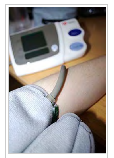
Checking blood pressure at home with an electronic sphygmomanometer.

Self-care includes exercising to maintain physical fitness and promote good mental health. The Center for Disease Control and Prevention (CDC) recommends 2 hours and thirty minutes of moderate activity each week. Examples of this include brisk walking, swimming, dancing, riding a bike, and even jumping rope. Another important aspect to self care includes eating well