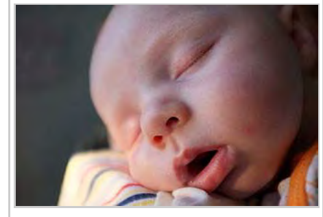
Sleep is a fundamental human need