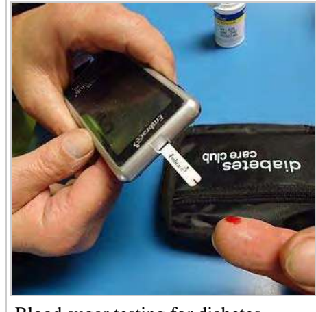
Blood sugar testing for diabetes

The benefits of living a healthy lifestyle were analysed in the Caerphilly Heart Disease Study. Evidence showed a risk reduction in chronic diseases (including dementia and cognitive impairment) to be significantly associated with healthy lifestyles.<sup>[10]</sup>