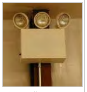
Three bulb emergency light in a residential building.