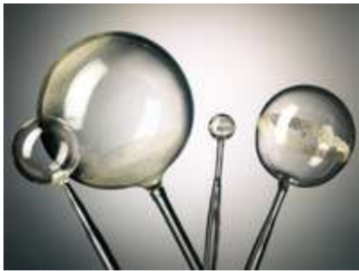
Sulfur bulbs S.I. image #lar2-2f1

In 1980 Ury and Wood tried placing sulfur in their linear UV lamp without success. One lamp "blew up," and they shelved the idea. By 1986 they had improved the basic design of the UV lamp by replacing the linear tube with a rotating sphere. Ury decided to try making an electrodeless metal-halide lamp that might be useful in motion picture lighting. The design had color problems, and this project also was shelved.