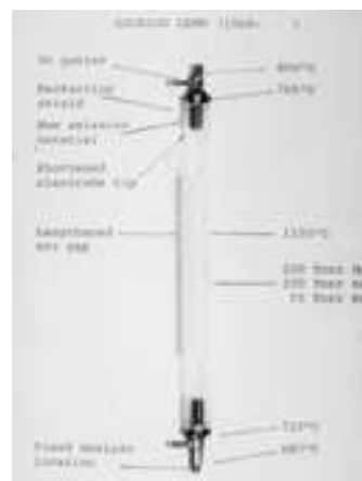
Lucalox tube S.I. image #99-4125