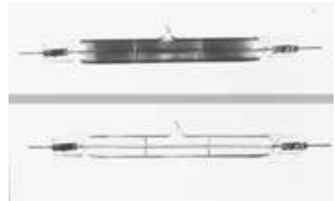
Lamp before & after halogen cycle