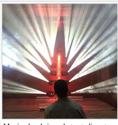
Moving heads in a photo studio set.