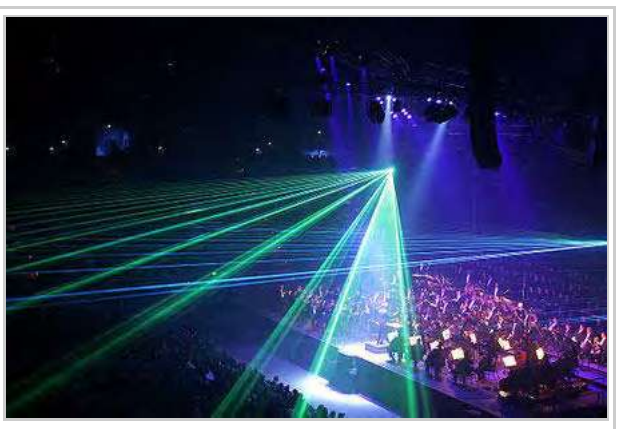
Low-intensity lighting and haze in a concert hall allows laser effects to be visible