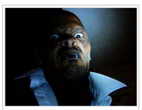
Illuminating subject from beneath to achieve a heightened dramatic effect.

The SI unit of illuminance and luminous emittance, being the luminous power per area, is measured in Lux. It is used in photometry as a measure of the intensity, as perceived by the human eye, of light that hits or passes through a surface. It is analogous to the radiometric unit watts per square metre, but with the power at each wavelength weighted according to the luminosity function, a standardized model of human visual brightness perception. In English, "lux" is used in both singular and plural.<sup>[24]</sup>