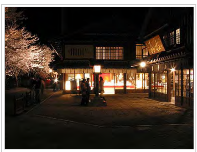
Illuminated Cherry blossoms, light from the shop windows, and Japanese lantern at night in Ise, Mie, Japan