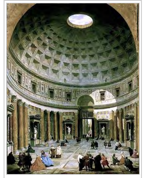
Lighting without windows: The Pantheon in the 18th century, painted by Giovanni Paolo Panini.<sup>[22]</sup>

measuring the amount of useful light. The basic SI unit of measurement is the candela (cd), which describes the luminous intensity, all other photometric units are derived from the candela. Luminance for instance is a measure of the density of luminous intensity in a given direction. It describes the amount of light that passes through or is emitted from a particular area, and falls within a given solid angle. The SI unit for luminance is