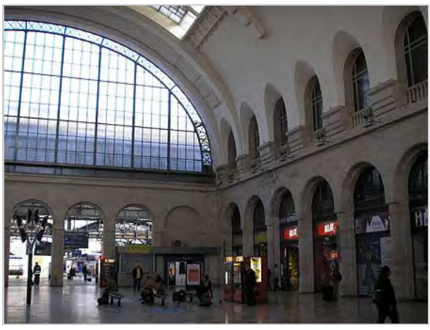
Daylight used at the train station Gare de l'Est Paris