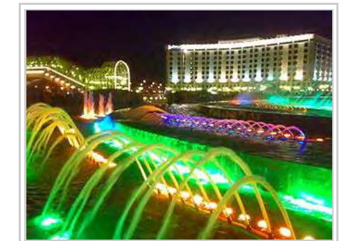
Animated fountain in Moscow's Square of Europe, lit at night.

Floodlights can be used to illuminate outdoor playing fields or work zones during nighttime hours. The most common type of floodlights are metal halide and high pressure