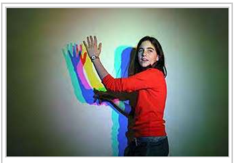
Lighting and shadows