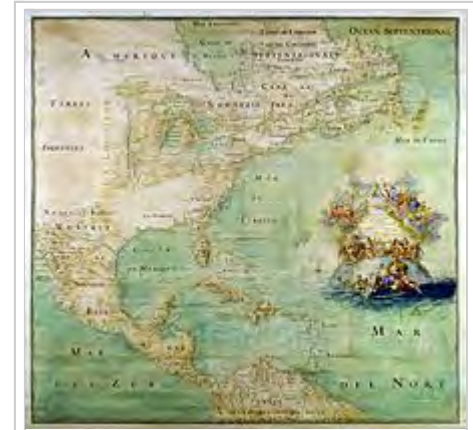
1681 map of North America

Maps of the New World had been produced since the 16th century. The history of cartography of the United States of America begins in the 18th century, after the declared independence of the Thirteen original colonies on July 4, 1776, during the American Revolutionary War (1775-1783). Later, Samuel Augustus Mitchell published a map of the United States in 1867. The National Program for Topographic Mapping was initiated in 1884 by the United States Geological Survey.