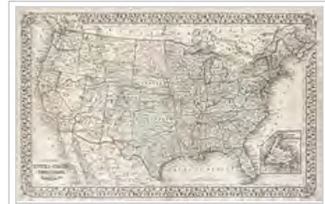
Mitchell's 1867 map of the United States

Some maps show the state lines (boundaries) of the individual states, whereas other maps simply show the national boundaries between the United States and other nations. USA consists of 50 states and covers the total area of 3,679,245 sq. miles. The population of USA was 281,421,906 in 2000 census. There are 79.6 persons on average per square mile. In 2003 the estimated population of the country was 291,587,000.