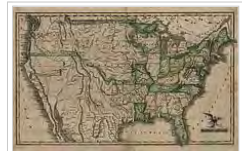
Antebellum map of the United States, published by Sidney E. Morse in An atlas of the United States (1823), showing the recent acquisition of Missouri and Louisiana, and the remnant of the Northwest Territory after the establishment of Ohio, Indiana and Illinois

As the United States of America changed territorial lines, maps were updated and redrawn, e.g. when the new state Hawaii was added on August 21, 1959.