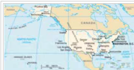
Map of the United States of America, showing Hawaii ( lower left ), which became a U.S. state in August 1959

The map of the US shows that it is bordered with Canada on the North, by Mexico on South and the Bahamas on the southeast. Alaska, a state of the USA, is bordered with Canada on the East and Russia on the west. The map also shows the relation of the country with its neighbor hood countries.