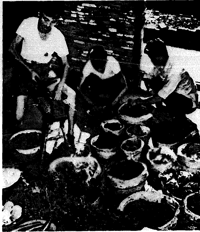
FIGURE 2. The clinic staff of a production brigade in Changshu County, Kiangsu Province, process the medicinal herbs they have gathered ( Medical Workers Serving The People Wholeheartedly , Foreign Languages Press, Peking 1971)

acupuncture anesthesia have been revealed. Two facts have been demonstrated: (1) That Western and Chinese traditional medical practices are not irreconcilable, and (2) that further potential usefulness of traditional Chinese medicine to medical science would require the use of Western scientific methods to analyze systematically and thoroughly and to identify and clarify causative factors and relationships.