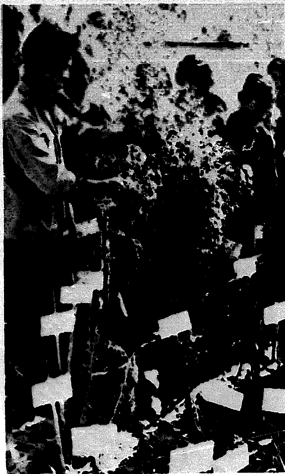
FIGURE 3. A health worker shows commune members the different medicinal plants and explains what they can do in treating and preventing diseases.