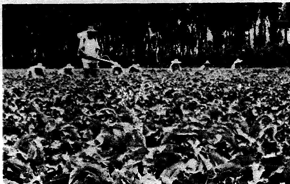
FIGURE 1. The Aster tartaricus cultivated by the Cadres' School of the Peking First Commerce Bureau. Chinese medicinal herbs are grown over large areas in the communes and brigades in the suburban counties of Peking (China Pictorial, Nov. 1971)

drugs (Fig. 3). There have been projects all over the country to accelerate cultivation and to introduce new medicinal herbs. Also, a number of medicinal plants reportedly have been successfully transplanted. For example, the famous ginseng , which was thought to be adaptable for cultivation only in the northeastern provinces, has been successfully planted in other areas, such as Shansi, Hopei, and Yunnan. 34 Carthamus tinctorius , Chrysanthemum incanum L. and Dioscorea japonica have been introduced to Kiangsu, Shanghai, Shantung, and Kuangtung. As they are produced locally, the needs for these plants in these provinces are met. There have also been large amounts of surplus to supply other regions where these plants are not grown.