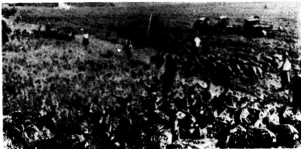
FIGURE 4. The Sika deer is a wild animal of great economic value. The knobs and collagen of its antlers are effective in promoting various functions of the human body, treating weakness of the heart muscle and hastening the healing of wounds. The antlers, after processing, are used for ulcers and swellings. The foetus, tendons, tail and viscera of the deer can be made into medicine. Deer raising has developed rapidly in China in the past few years. Herds of deer grazing on a P.L.A. farm. ( China Pictorial , Nov. 1971)