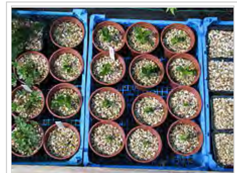
Gentian seedlings in a plant nursery