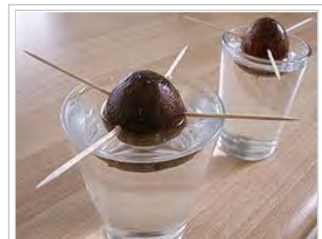
One way to propagate an avocado seed

Some plants (like certain [1] F1/F2 hybrids and GMO plants) may produce seed, but not fertile seed. [2] In certain cases (like with GMO's), this is done to prevent the accidental spreading of these plants (which are generally non-native crops), for example by birds and other animals.