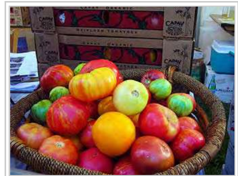
A selection of heirloom tomatoes

In the 21st century, numerous community groups all over the world are working to preserve historic varieties to make a wide variety of fruit trees available again to the home gardener, by renovating old orchards, sourcing historic fruit varieties and encouraging community participation.