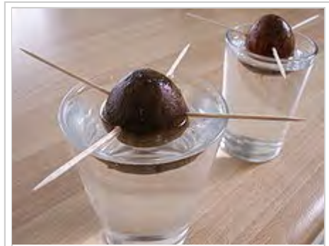
Tropical fruit such as avocado also benefit from special seed treatments (specifically invented for that particular tropical fruit)

Seed soaking is generally done by placing seeds in medium hot water for at least 24 to up to 48 hours [2] Seed cleaning is done especially with fruit, as the flesh of the fruit around the seed can quickly become prone to attack from insects or plagues. [3][4] To clean the seed, usually seed rubbings with cloth/paper is performed, sometimes assisted with a seed washing. [5] Seed washing is generally done by submerging cleansed seeds 20 minutes in 50 degree Celsius water. [6] This (rather hot than moderately hot) water kills any organisms that may have survived on the skin of a seed. Especially with easily infected tropical fruit such as lychees and rambutans, seed washing with high temperature water is vital.