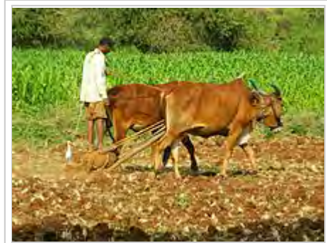
Traditional Sowing Methods

A seed rate of about 100 kg of seed per hectare (2 bushels per acre) is typical, though rates vary considerably depending on crop species, soil conditions, and farmer's preference. Excessive rates can cause the crop to lodge, while too thin a rate will result in poor utilisation of the land, competition with weeds and a reduction in the yield.