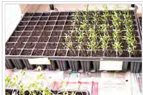
A tray used in horticulture (for sowing and taking plant cuttings)