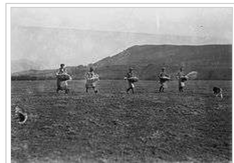
Men sowing seed by hand in the 1940s