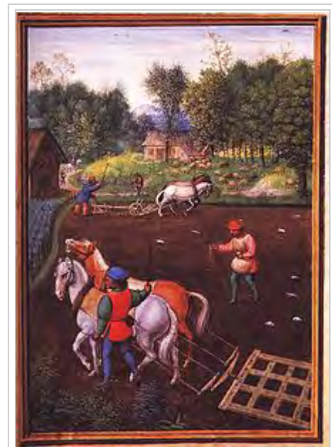
Simon Bening, Labors of the Months: September , from a Flemish Book of hours (Bruges)