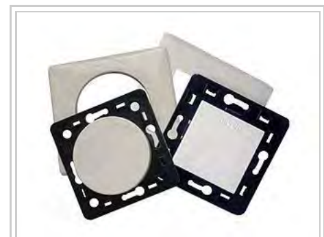
picture of a batteryless and wireless wallswitch

Most piezoelectric electricity sources produce power on the order of milliwatts, too small for system application, but enough for hand-held devices such as some commercially available self-winding wristwatches. One proposal is that they are used for micro-scale