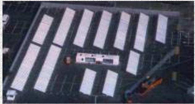
Aerial view of a CAN! facility near the Los Angeles airport