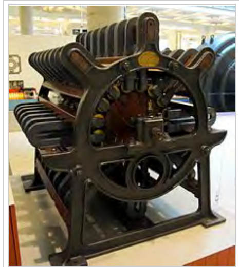
2kW Soci t  de l'Alliance magneto generator for arc lamps, of around 1870

Magnetos date from the earliest days of electrical engineering. Despite this, they have never been widely applied for the purposes of bulk electricity generation, for the same purposes or to the same extent as either dynamos or alternators. Only in a few specialised cases, as described here, have they been used for power generation.