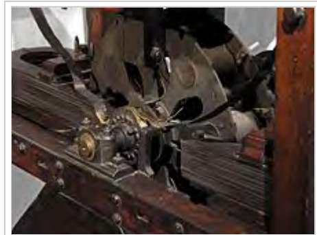
Commutator of the Woolrich Electrical Generator

The surviving machine has an applied field from four horseshoe magnets with axial fields. The rotor has ten axial bobbins. Electroplating requires DC and so the usual AC magneto is unworkable. Woolrich's machine, unusually, has a commutator to rectify its output to DC.