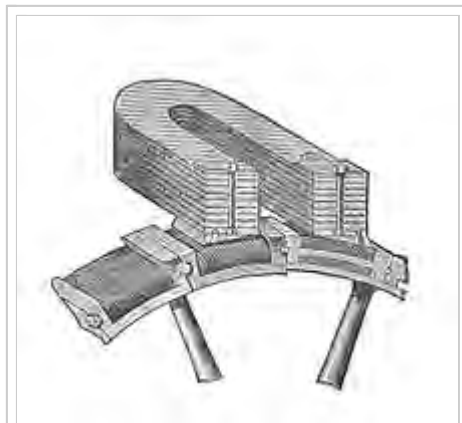
de Méritens' 'ring wound' armature and single pole piece

To achieve an adequate output power, magneto generators used many more poles; usually sixteen, from eight horseshoe magnets arranged in a ring. As the flux available was limited by the magnet metallurgy, the only option was to increase the field by using more magnets. As this was still an inadequate power, extra rotor disks were stacked axially, along the axle. This had the advantage that each rotor disk could at least share the flux of two expensive magnets. The machine illustrated here uses eight disks and nine rows of magnets: 72 magnets in all.