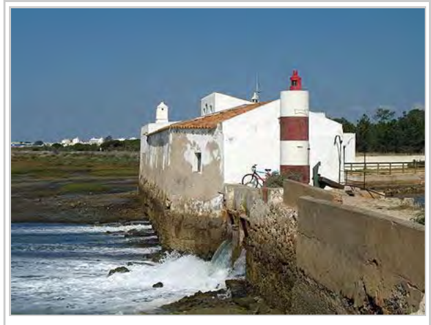
Tidal mill at Olhão, Portugal

A modern version of a tide mill is the electricity generating tidal barrage.