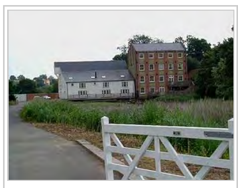
Fingringoe Tide Mill