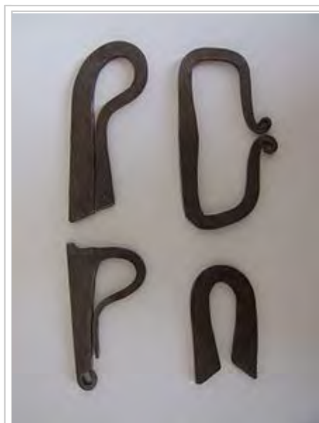
Assorted reproduction firesteels typical of Roman to medieval period

In Japan, percussion firemaking was performed, using agate or quartz. It was also used as a ritual to bring good luck or ward off evil. [7] [8]