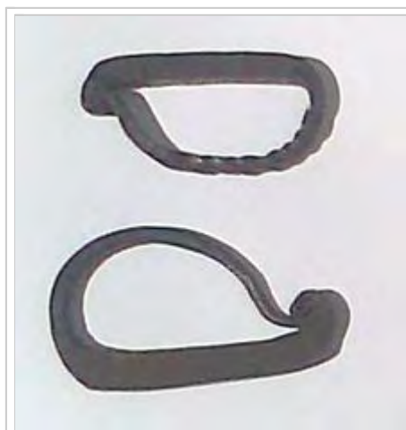
Late 18th century firesteels from Brittany