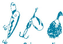
Crankbait Spinner Jig

Fishing lures—crankbaits, spoons, jigs, spinners, flies, and soft lures like plastic worms—are excellent artificial baits but may require special fishing techniques. This is called “working” the lure.