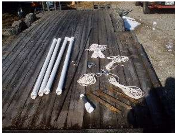
Mast ready to go up

Measure approx 16' out from where the bottom of the mast will be in 120 degree intervals.