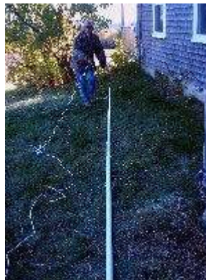
JW tryin' to look busy!

Lay out the guy ropes in their respective direction. Attach 2 of the top guy ropes to 2 stakes. The mast must be completely assembled and laying on the ground with the top FACING the 3 rd stake. The antenna & coax must also be installed. Nothing is tied off to the 3 rd stake yet.