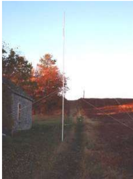
1 st time it was up.