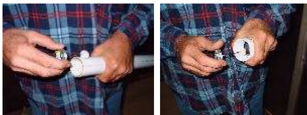
Apply glue to pipe Apply glue to coupling

This is the pictorial procedure for gluing all PVC pipe, couplings, fittings etc. regardless of the application. The steps in constructing the mast follow.