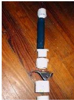
Exploded view of top