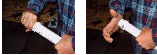
Twist coupling onto pipe Hit it with your hand to seat coupling