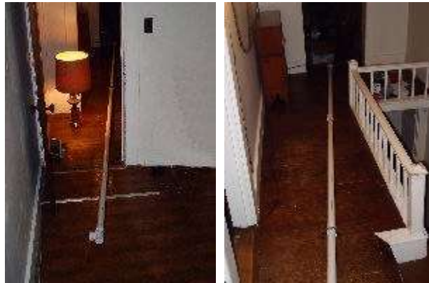
Bottom showing "T" fitting Mid- section showing guy bracket

Now, let's look at the mast laid out on the floor, loosely assembled. Just so you get the overall picture of the final product.