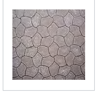
More decorative brickwork patterns.