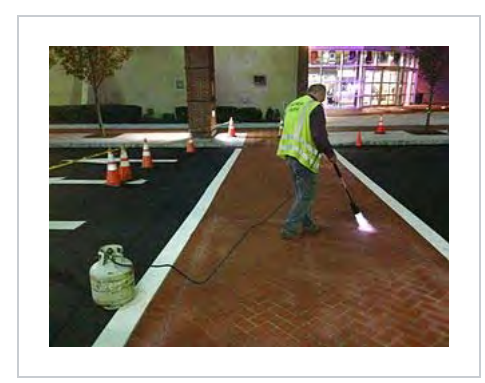
Polymer cement overlaying to change asphalt pavement to brick texture and color to create decorative crosswalk