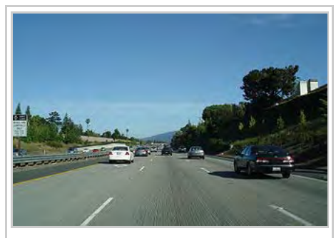
Concrete roadway in San Jose, California

Concrete surfaces (specifically, Portland cement concrete) are created using a concrete mix of Portland cement, coarse aggregate, sand and water. In virtually all modern mixes there will also be various admixtures added to increase workability, reduce the required amount of water, mitigate harmful chemical reactions and for other beneficial purposes. In many cases there will also be Portland cement substitutes added, such as fly ash. This can reduce the cost of the concrete and improve its physical properties. The material is applied in a freshly mixed slurry, and worked mechanically to compact the interior and force some of the cement slurry to the surface to produce a smoother, denser surface free from honeycombing. The water allows the mix to combine molecularly in a chemical reaction called hydration.