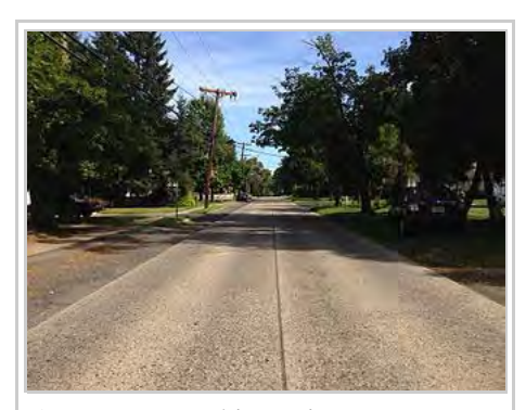
A concrete road in Ewing, New Jersey. The original pavement was laid in the 1950s and has not been significantly altered since.

Continuously reinforced designs may cost slightly more than jointed reinforced or jointed plain designs due to increased quantities of steel. Often the cost of the steel is offset by the reduced cost of concrete because a continuously reinforced design is nearly always significantly thinner than a jointed design for the same traffic loads. Properly designed, the two methods should demonstrate similar long-term performance and cost-effectiveness. A number of agencies have made policy decisions to use continuously reinforced designs in their heavy urban traffic corridors.