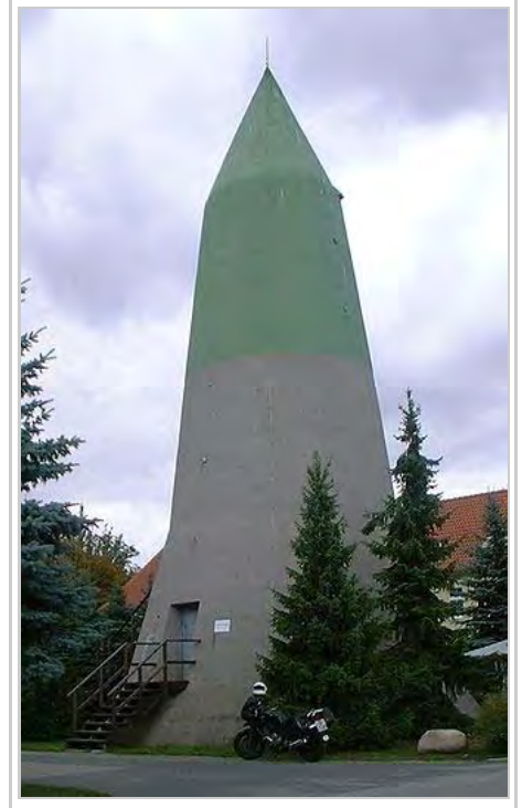
Winkelturm in Wünsdorf, Brandenburg

Alternatives had to be found speedily once it became clear that Germany was contemplating air raids as a means of demoralising the population and disrupting supply lines in the UK. Initial recommendations were that householders should shelter under the stairs. Later, authorities supplied materials to households to construct communal street shelters and Morrison and Anderson shelters.