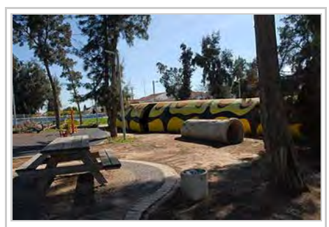
An example of a bomb shelter at a playground in Israel.