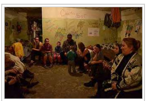
Air-raid shelter in separatist-held Donetsk, eastern Ukraine, March 2015