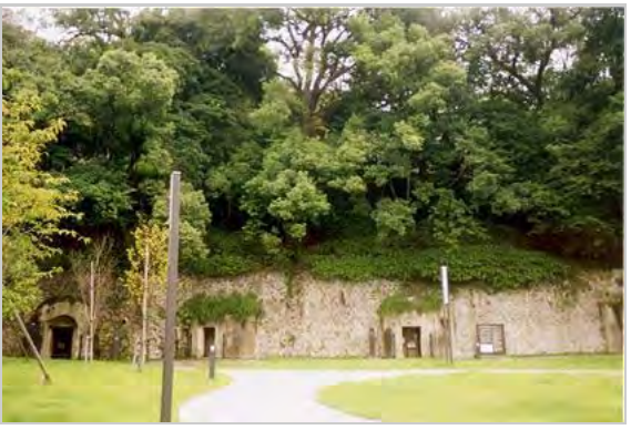
Air-raid shelter in Tateyama, Nagasaki, Nagasaki.