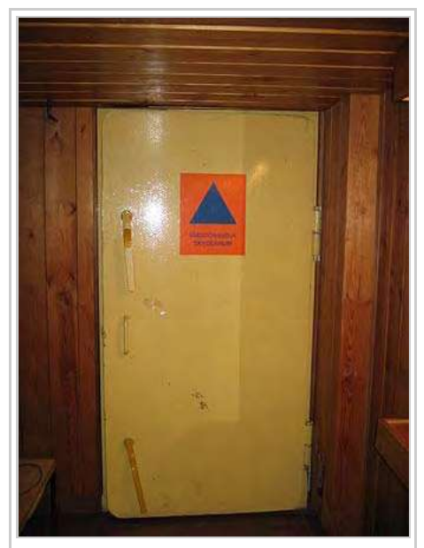
A normal Finnish S1-shelter steel door. S is short for suoja (protection, shelter).