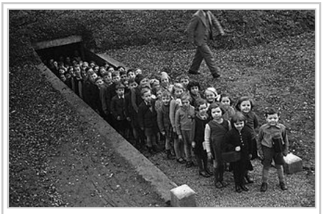
Children outside air raid shelter in Gresford, 1939