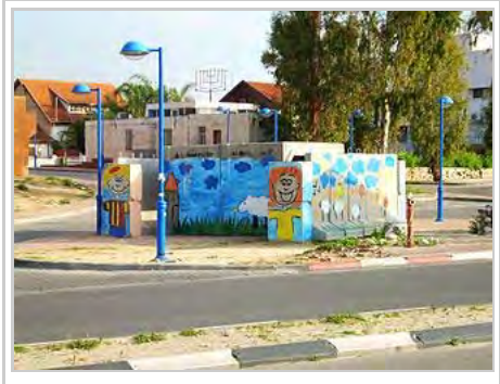
Entrance to a public bomb shelter in Sderot, Israel.