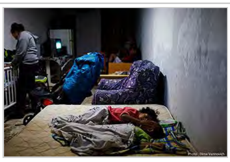
The inside of an Israeli bomb shelter in 2012.