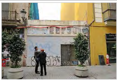
Air-raid shelter built during the Spanish Civil War in Valencia.