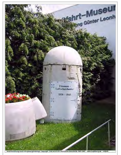
Single-person air raid shelter in Germany on display in an aviation museum

One particular variant of the Hochbunker was the Winkeltürme , named after its designer, Leo Winkel of Duisburg. Winkel patented his design in 1934, and from 1936 on, Germany built 98 Winkeltürme of five different types. The towers had a conical shape with walls that curved downward to a reinforced base. The dimensions of the towers varied.