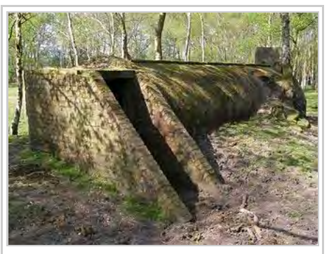
An abandoned Stanton shelter at the disused airfield, RAF Beaulieu (2007)

shelters are often used as storage, with the footprint of the reinforced basement divided up into individual storage units according to the number of apartments in the house. The basement shelters are built to more