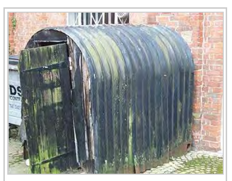
An unburied Anderson Shelter in 2007; this shelter had seen use after the war as a shed

Anderson shelters were issued free to all householders who earned less than £5 a week (equivalent to £280 in 2015, when adjusted for inflation). Those with a higher income were charged £7 (£390 in 2015) for their shelter. One and a half million shelters of this type were