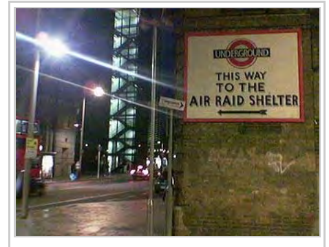
Recreation of a London Underground air raid shelter Sign

Seal and, on the declaration of war, Home Secretary and Minister of Home Security. Anderson announced the policy to Parliament on 20 April 1939,<sup>[12]</sup> based on a report from a committee chaired by Lord Hailey. This reaffirmed a policy of dispersal and eschewed the use of deep shelters, including the use of tube stations and underground tunnels as public shelters. Reasons given were the spread of disease due to the lack of toilet facilities at many stations, the inherent danger of people falling onto the lines, and that people sheltering in the stations and tunnels might be tempted to stay in them day and night because they would feel safer there than outside the stations.