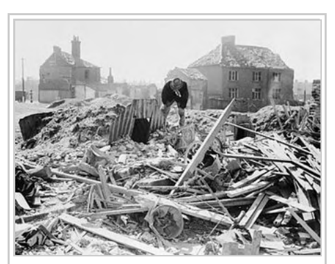
Two Anderson shelters standing intact amid a scene of debris in Norwich.

Anderson shelters were designed to accommodate up to six people. The main principle of protection was based on curved and straight galvanised corrugated steel panels. Six curved panels were bolted together at the top, so forming the main body of the shelter, three straight sheets on either side, and two more straight panels were fixed to each end, one containing the door—a total of fourteen panels. A