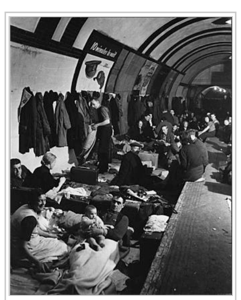
London Underground station in use as an air-raid shelter during World War II.

On 16 September 1940, at Marble Arch tube station, 20 people were killed.