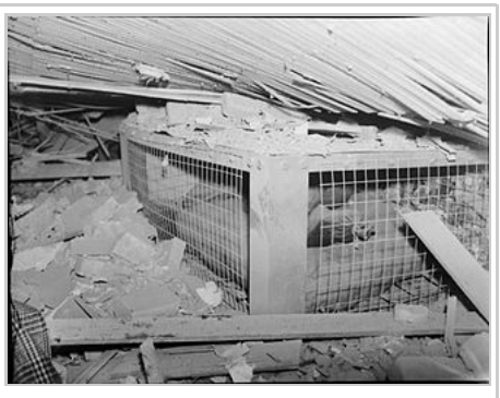
A Morrison shelter containing a dummy, after the house it was in had been destroyed as a test

In one examination of 44 severely damaged houses it was found that three people had been killed, 13 seriously injured, and 16 slightly injured out of a total of 136 people who had occupied Morrison shelters; thus 120 out of 136 escaped from severely bomb-damaged houses without serious injury. Furthermore, it was discovered that the fatalities had occurred in a house which had suffered a direct hit, and some of the severely injured were in shelters sited incorrectly within the houses.<sup>[23]</sup>