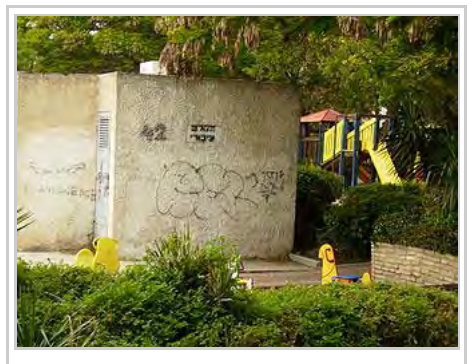
A communal air raid shelter located in a public garden in Holon, Israel