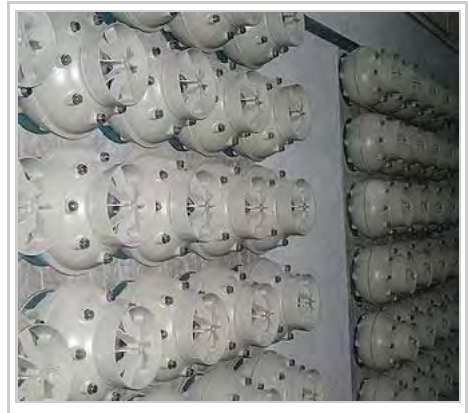
Blast protection valves installed in a bomb shelter