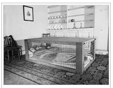
A couple demonstrating the use of a Morrison shelter

Half a million Morrison shelters had been distributed by the end of 1941, with a further 100,000 being added in 1943 to prepare the population for the expected German V-1 flying bomb (doodlebug) attacks.