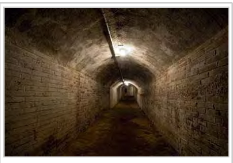
Air-raid Shelter 307 (Refugi 307) in Barcelona, was built during Spanish Civil War