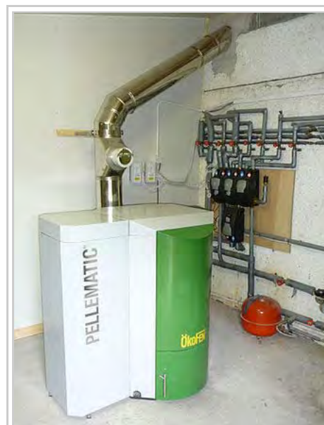
Pellet burning central heating system in basement of family home