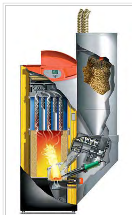
Modern pellet stove cross section

Unlike wood stoves which operate exclusively on a principle of chimney draft, a pellet stove must use specially sealed exhaust pipe to prevent exhaust gases escaping into the living space due to the air pressure produced by a combustion blower. Pellet stoves require certified double walled venting, normally three or four inches in diameter with a stainless steel interior and galvanized exterior. Because pellet stoves have a forced exhaust system, they have the advantage of not always requiring a vertical rise to vent, although a 3-to-5-foot (0.91 to 1.52 m) vertical run to induce some draft is recommended to prevent leakage in the case of a power outage. Like a modern gas appliance, pellet stoves can be vented horizontally through an outside wall and terminated below the roof line, making it an excellent choice for structures without an existing chimney. If an existing chimney is available, manufacturers urge use of a