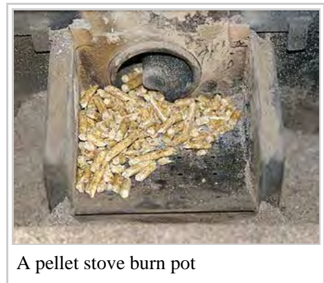
A pellet stove burn pot

To properly function, a pellet stove uses electricity and can be connected to a standard electrical outlet. A pellet stove, like an automatic coal stoker, is a consistent heater consuming fuel that is fed evenly from a refillable hopper into the burn pot (a perforated cast-iron or steel basin), through a motorized system. The most commonly used distributor is an auger system that consists of a spiral length of metal encased in a tube. This mechanism is either located above the burn pot or slightly beneath and guides a portion of pellet fuel from the hopper upwards until it falls into the burn pot for combustion.