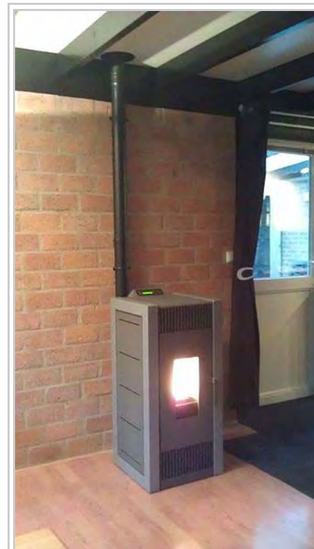
A modern pellet stove

A pellet stove is a stove that burns compressed wood or biomass pellets to create a source of heat for residential and sometimes industrial spaces. By steadily feeding fuel from a storage container (hopper) into a burn pot area, it produces a constant flame that requires little to no physical adjustments. Today's central heating systems operated with wood pellets as a renewable energy source can reach an efficiency factor of more than 90%.