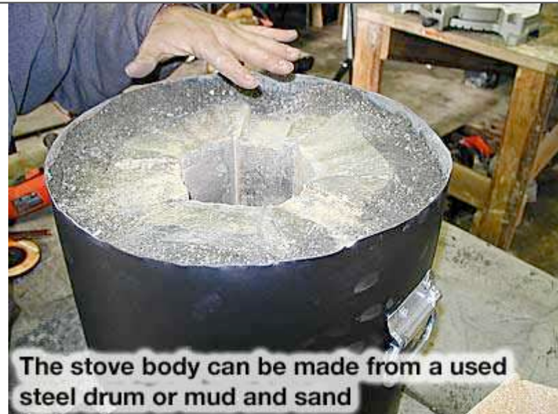
16: A shelf holds burning sticks of wood above the floor of the combustion chamber