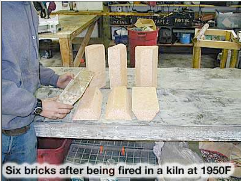
Six bricks after being fired in a kiln at 1950F

11: Each 12 inch (300 mm) tall brick weighs 1.5 lb. (2 kg), about half the weight of water by volume