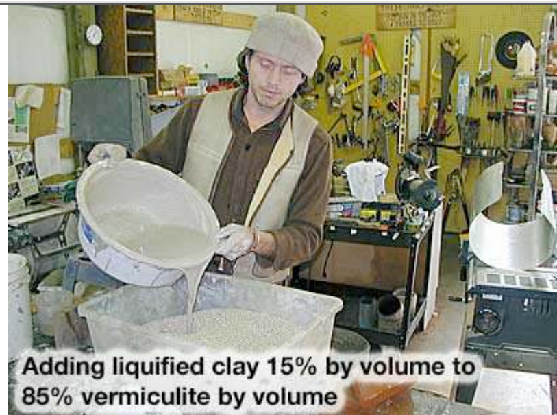
Adding liquified clay 15% by volume to 85% vermiculite by volume