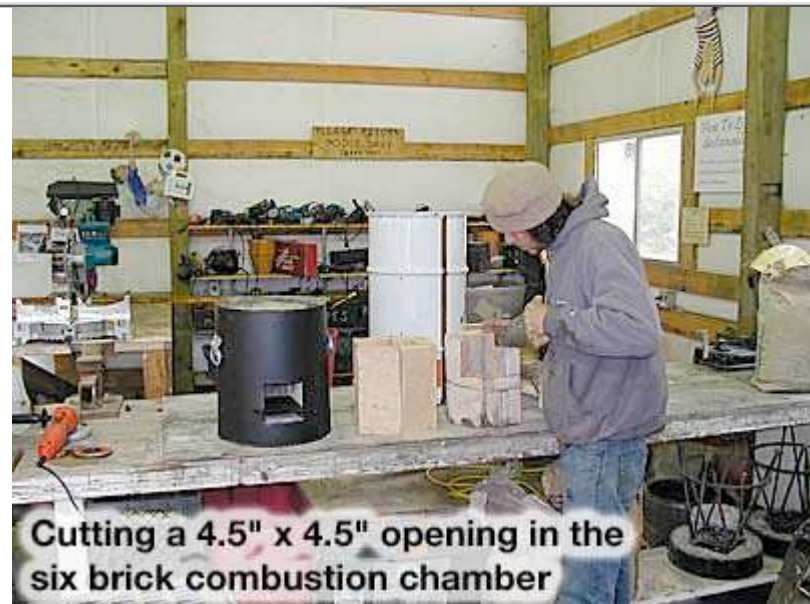
Cutting a 4.5" x 4.5" opening in the six brick combustion chamber

13: The six bricks form a 12" (300 mm) tall hollow highly insulative cylinder with walls 2.5" (65 mm) thick