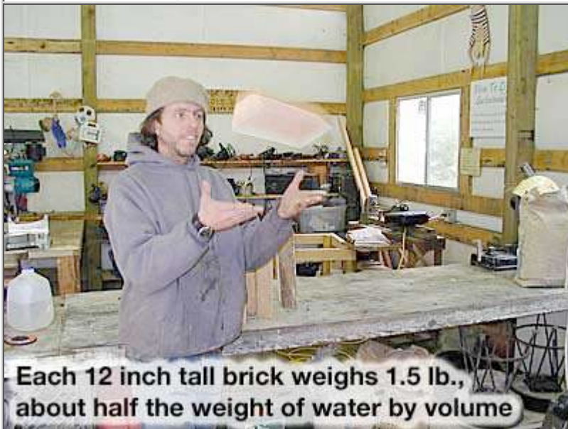
Each 12 inch tall brick weighs 1.5 lb., about half the weight of water by volume

12: Cutting a 4.5" x 4.5" (115 mm square) opening in the six brick combustion chamber