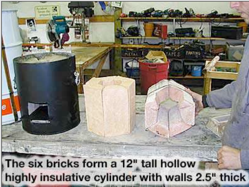
15: A 4.5" x 4.5" (115 mm) square opening makes the fuel magazine