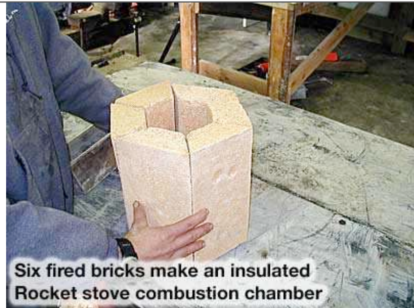
Six fired bricks make an insulated Rocket stove combustion chamber

11: Each 12 inch (300 mm) tall brick weighs 1.5 lb. (2 kg), about half the weight of water by volume