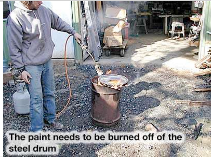
20: Three bolts serve as the pot supports