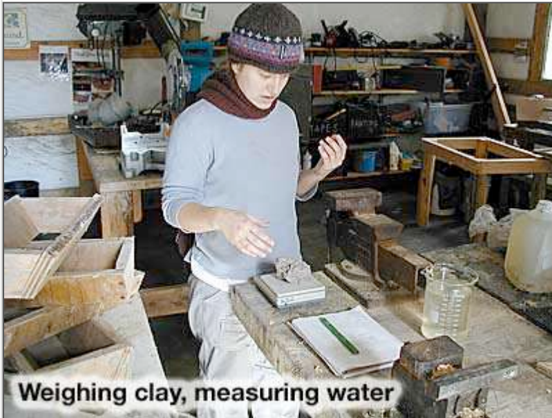
Weighing clay, measuring water