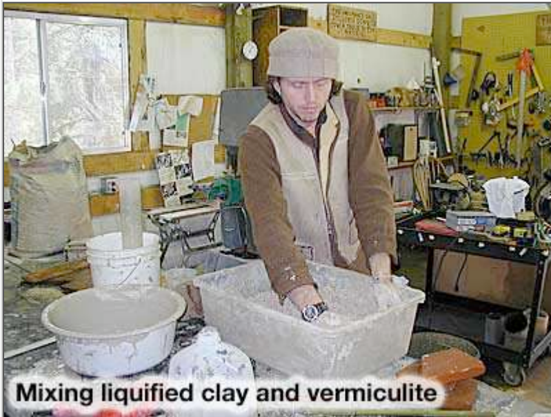
Mixing liquified clay and vermiculite