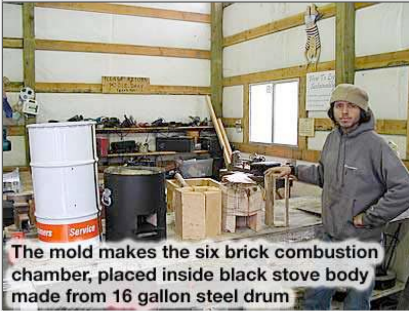
19: The removable lid becomes the top of the stove body