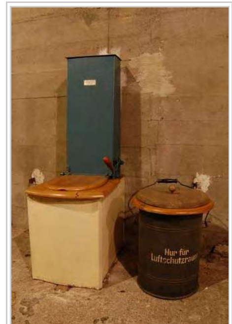
Example of a historical dry toilet with peat dispenser which was used in bunkers during World War II in Berlin (Metroclo by Gefinal)

Some people strongly believe that dry toilets (and "dry sanitation") are the more sustainable way for sanitation, whereas others argue that a generalisation is not possible and all the different sanitation systems have their place for all the different contexts. Dry toilets - or "dry sanitation systems" - can lead to reduced water