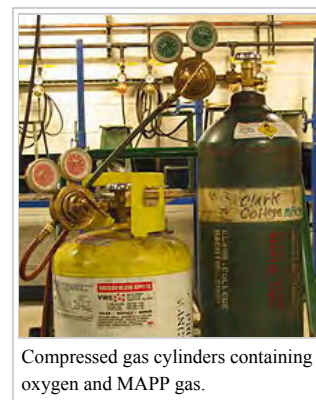
Compressed gas cylinders containing oxygen and MAPP gas.