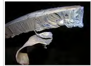
Side of metal, cut by oxygen - propane cutting torch