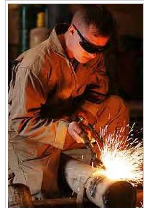
A cutting torch is used to cut a steel pipe.