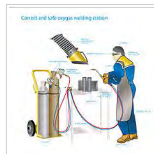
Oxygas welding station (keep cylinders and hoses away from the flame)

Almost every piece of metal is an alloy of one type or another. Copper, aluminium, and other base metals are occasionally alloyed with beryllium, which is a highly toxic metal. When a metal like this is welded or cut, high concentrations of toxic beryllium fumes are released. Long-term exposure to beryllium may result in shortness of breath, chronic cough, and significant weight loss, accompanied by fatigue and general weakness. Other alloying elements such as arsenic, manganese, silver, and aluminium can cause sickness to those who are exposed.