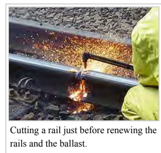
Cutting a rail just before renewing the rails and the ballast.