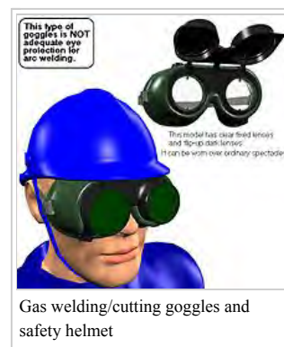
Gas welding/cutting goggles and safety helmet