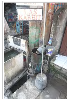
Acetylene generator as used in Bali by a reaction of calcium carbide with water. This is used where acetylene cylinders are not available. The term 'Las Karbit' means acetylene (carbide) welding in Indonesian.

Propylene is used in production welding and cutting. It cuts similarly to propane. When propylene is used, the torch rarely needs tip cleaning. There is often a substantial advantage to cutting with an injector torch (see the propane section) rather than an equal-pressure torch when using propylene. Quite a few North American suppliers have begun selling propylene under proprietary trademarks such as FG2 and Fuel-Max.