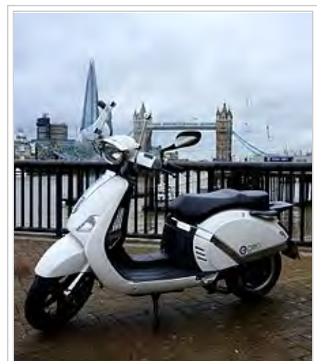
eGen eG3 electric scooter