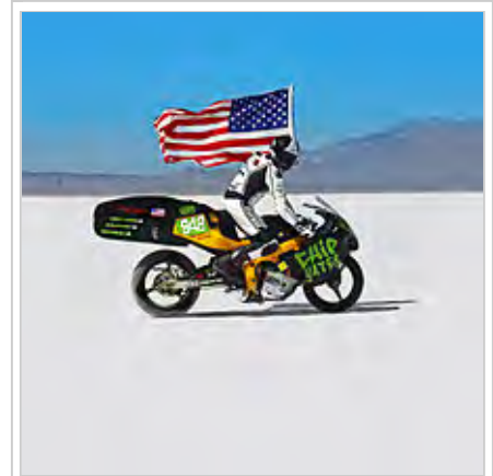
Chip Yates at Bonneville in 2011

quarter mile record of 7.824 seconds breaking the 8 seconds barrier at 168 miles per hour (270 km/h) in Phoenix, Arizona at the All Harley Drag Racing Association (AHDRA) 2007, on 10 November 2007. [33]