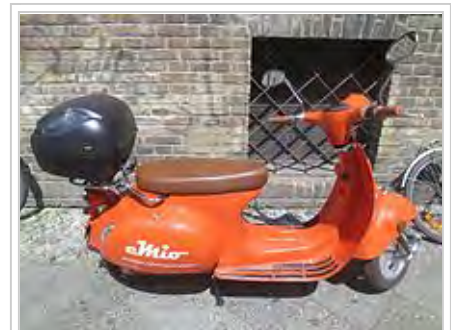
Electric Scooter in Berlin. Designed for an app based sharing system.

In January 2013, the Indian government announced a plan to provide subsidies for hybrid and electric vehicles. The plan will have subsidies up to ₹ 150000 for cars and 50000 on two wheelers. India aims to have seven million electric vehicles on the road by 2020. [75]