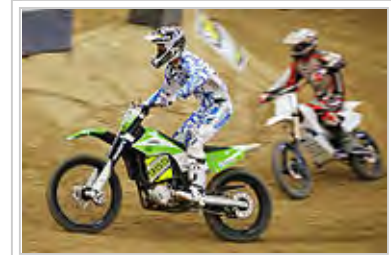
A Brammo Engage at MiniMoto SX (2011)