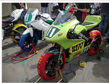
TTXGP bikes at Isle of Man TT 2009

On 26 August 2000, Killacycle established a drag racing record of completing a quarter mile (400 m) in 9.450 seconds on the Woodburn track in Oregon. Killacycle used lead acid batteries at a speed of 152.07 mph (244.73 km/h). [32] Later, Killacycle using A123 Systems Li-ion nano-phosphate cells set a new