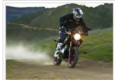
Zero DS (motorcycle)

Z Electric Vehicle is a US based commercial production supplier of electric scooters for worldwide markets. [6] The BMW C Evolution electric scooter was released in Germany in May 2014. [7] Honda participated in European lease demonstration and driving tests for its electric scooter in 2012 but has not yet announced its availability for sale. [8] Terra Motors, a Japanese electric vehicle maker, will begin selling electric scooters in India by 2015. [9] Gogoro announced a swappable battery electric scooter at CES 2015. [10] eGen is a UK based company offering a variety of electric scooters utilising lithium iron phosphate batteries [11]