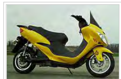
ZEV 7100LR (lead/sodium silicate battery)

Alternative types of batteries are available. Z Electric Vehicle has pioneered use of a lead/sodium silicate battery (a variation on the classic lead acid battery invented in 1859, still prevalent in automobiles) that compares favorably with lithium batteries in size, weight, and energy capacity, at considerably less cost. [43] EGen says its lithium-iron phosphate batteries are up to two-thirds lighter than lead acid batteries and offer the best battery performance for electric vehicles. [11]