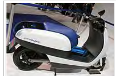
Yamaha FC-AQEL (fuel cell prototype)

All electric scooters and motorcycles provide for recharging by plugging into ordinary wall outlets, usually taking about eight hours to recharge (i.e. overnight). Some manufacturers have designed in, included, or offer as an accessory, the high-power CHAdeMO level 2 charger, which can charge the batteries up to 95% in an hour. [44]