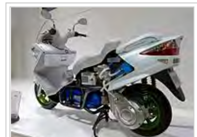
Suzuki Burgman (fuel cell prototype)

[48] Piaggio MP3 Hybrid uses a 125cc engine and an additional 2.4 kW motor. [49]