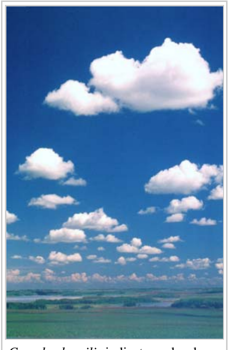
Cumulus humilis indicates a dry day ahead.