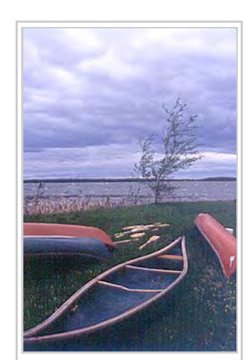
Cold, blustery northerly winds typically accompany a low pressure system.

When the wind is blowing in the North No fisherman should set forth, When the wind is blowing in the East, 'Tis not fit for man nor beast, When the wind is blowing in the South It brings the food over the fish's mouth, When the wind is blowing in the West, That is when the fishing's best!