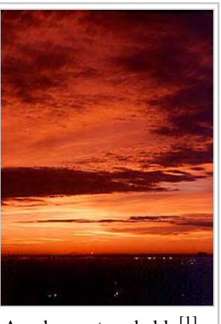
A red sunset probably<sup>[1]</sup> means dry weather the next day.

When the wind is blowing in the North No fisherman should set forth, When the wind is blowing in the East, 'Tis not fit for man nor beast, When the wind is blowing in the South It brings the food over the fish's mouth, When the wind is blowing in the West, That is when the fishing's best!