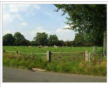
"When cows are lying down in a field, rain is on its way" may not be a scientific prediction, and yet animal behavior at times of changing pressure systems makes for interesting theories. Are cool updrafts or the hovering of flies on their bellies a factor?

Fog is formed when the air cools enough that the vapor pressure encourages condensation over evaporation. In order for the air to be cool