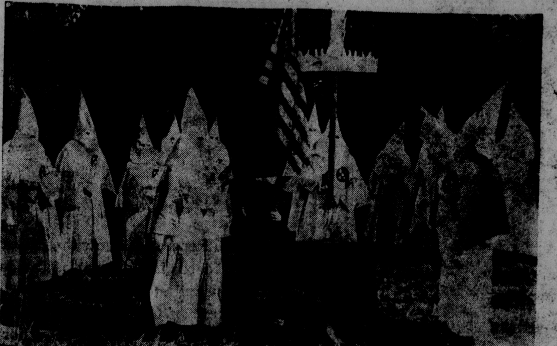
An actual photograph showing the ghostly-clad knights of the Invisible Empire in the very act of initiating another member into the Ku Klux Klan. A resolution has been presented in the House of Representatives to ascertain whether or not these mysterious initiations have been held under the very dome of the Capitol in Washington.

If the Ku Klux Klan has committed the murders, lynchings, assaults—and worse—that are attributed to the order, then Senator Walsh wants the government, by direct presidential proclamation, to eradicate the entire "Invisible Empire." Is there danger that the hoof beats of the ghostly-clad midnight rider may resound through the still streets of New England's cities and towns? Are members of the Klan, through sinister methods, gathering under the very dome of the Capitol of this nation? Then Senator Walsh demands, from the floor of the Senate itself, that the whole truth about the purposes, actions, beliefs and plans of the Ku Klux Klan be made public at