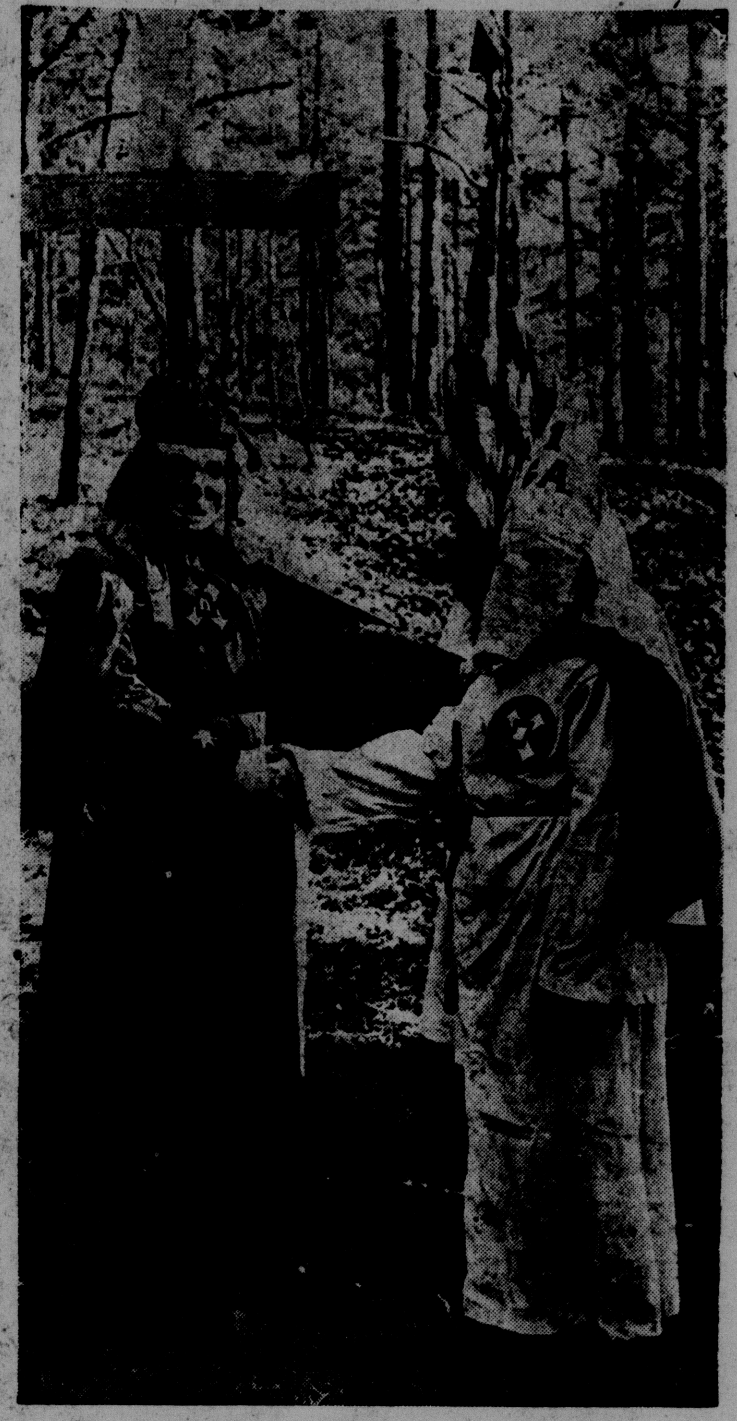
Showing two high officials of the Ku Klux Klan, dressed in their full regalia of office, clasping hands under the K. K. cross, in the isolation of the Southern woods. Costumes similar to these, according to the reports given below, are worn by members of the bands who are murdering and lynching in many sections of the country.

Rights to the State and federal constitution . . . When we examine the record of Mr. Mayfield (elected Senator from Texas on the endorsement of the Ku Klux Klan) it is enough to make any self-respecting American citizen ashamed. . . Every thinking man, and especially every Senator, should read and ponder his speech made before a gathering of Klansmen in the city of Dallas, Tex., just after his trial, in which he held up to ridicule the courts of the State and made reference to something the Ku Klux Klan was alleged to have said to the judge who presided at his trial. The sentiments uttered in this speech alone show that he is utterly out of sympathy with our established government, and should, on these grounds, if no others existed, be excluded from his seat in the United States Senate.