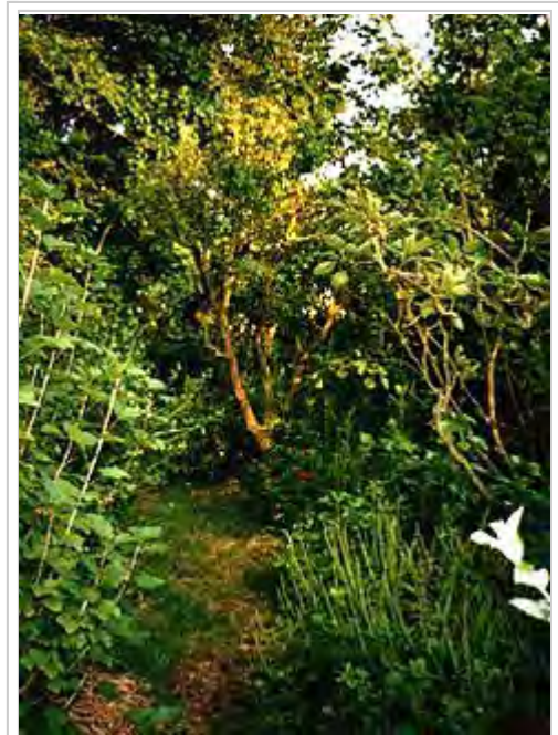
Robert Hart's forest garden in Shropshire