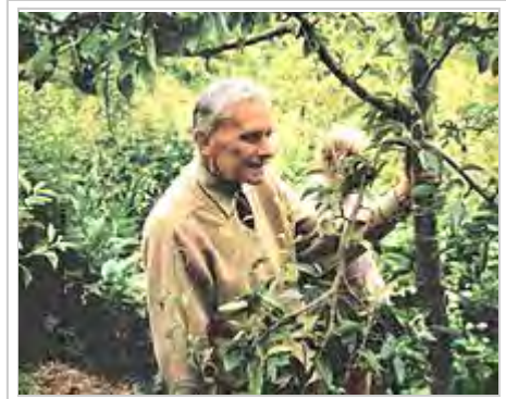
Robert Hart, forest gardening pioneer

Following Hart's adoption of a raw vegan diet for health and personal reasons, he replaced his farm animals with plants. The three main products from a forest garden are fruit, nuts and green leafy vegetables. [19] He created a model forest garden from a 0.12 acre (500 m 2 ) orchard on his farm and intended naming his gardening method ecological horticulture or ecocultivation . [20] Hart later dropped these terms once he became aware that agroforestry and forest gardens were already being used to describe similar systems in other parts of the world. [21] He was inspired by the forest farming methods of Toyohiko Kagawa and James Sholto Douglas, and the productivity of the Keralan home gardens as Hart explains: [22]