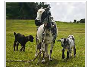
A female goat and two kids

important to make him attractive to the female. Some does will not mate with a buck which has been descended. [18]