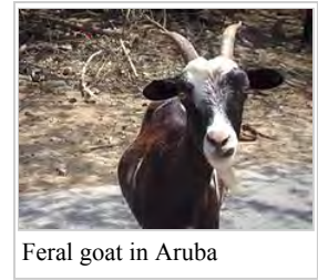
Feral goat in Aruba