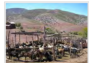
Goat husbandry is common through the Norte Chico region in Chile. Intensive goat husbandry in drylands may produce severe erosion and desertification. Image from upper Limarí River