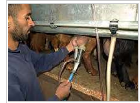
A goat being machine milked on an organic farm

On the other hand, some farming groups promote the practice. For example, Small Farm Today in 2005 claimed beneficial use in invalid and convalescent diets, proposing that glycerol ethers, possibly important in nutrition for nursing infants, are much higher in doe milk than in cow milk. [52] A 1970 book on animal breeding claimed doe milk differs from cow or human milk by having higher digestibility, distinct alkalinity, higher buffering capacity, and certain therapeutic values in human medicine and nutrition. [53] George Mateljan suggested doe milk can replace ewe milk or cow milk in diets of those who are allergic to certain mammals' milk. [54] However, like cow milk, doe milk has lactose (sugar), and may cause gastrointestinal problems for individuals with lactose intolerance. [54] In fact, the level of lactose is similar to that of bovine milk. [50]