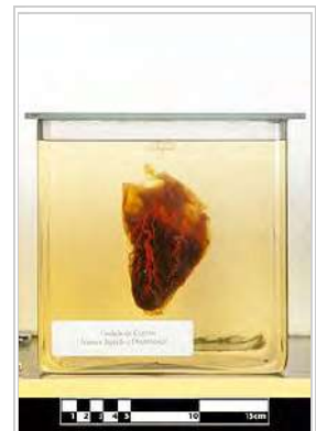
Goat heart. Specimen clarified for visualization of anatomical structures