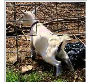
Goats are well known for being hard to contain with fencing.

Goats can become infected with various viral and bacterial diseases, such as foot-and-mouth disease, caprine arthritis encephalitis, caseous lymphadenitis, pinkeye, mastitis, and pseudorabies. They can transmit a number of zoonotic diseases to people, such as tuberculosis, brucellosis, Q-fever, and rabies. [32]