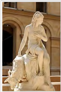
Amalthee et la chèvre de Jupiter (Amalthea and Jupiter's goat); commissioned by the Queen of France in 1787 for the royal dairy at Rambouillet

The goat is one of the twelve-year cycle of animals which appear in the Chinese zodiac related to the Chinese calendar. Each animal is associated with certain personality traits; those born in a year of the goat are predicted to be shy, introverted, creative, and perfectionist.