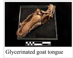
Glycerinated goat tongue

but was then modified. Specifically, when presented with a box, the goat was able to remove the lid and retrieve a treat inside, but when the box was turned so the lid could not be removed, the goat would turn and gaze at the person and move toward them, before looking back toward the box. This is the same type of complex communication observed by animals bred as domestic pets, such as dogs. Researchers believe that better understanding of human-goat interaction could offer overall improvement in the animals' welfare. [29][30] The field of Anthrozoology has established that domesticated animals have the capacity for complex communication with humans when in 2015 a Japanese scientist determined that levels of oxytocin did increase in human subjects when dogs were exposed to a dose of the "love hormone", proving that the Human Animal Bond does exist. This is the same affinity that was proven with the London study above; goats are intelligent, capable of complex communication, and able to form bonds. [31] Despite having the reputation of being slightly rebellious, more and more people today are choosing more exotic companion animals like goats. Goats are herd animals and typically prefer the company of other goats, but because of their herd mentality, they will follow their human around just the same.