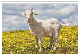
A two-month-old goat kid in a field of capeweed

In temperate climates and among the Swiss breeds, the breeding season commences as the day length shortens, and ends in early spring or before. In equatorial regions, goats are able to breed at any time of the year. Successful breeding in these regions depends more on available forage than on day length. Does of any breed or region come into estrus (heat) every 21 days for two to 48 hours. A doe in heat typically flags (vigorously wags) her tail often, stays near the buck if one is present, becomes more vocal, and may also show a decrease in appetite and milk production for the duration of the heat.