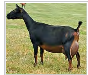
A Nigerian Dwarf milker in show clip. This doe is angular and dairy with a capacious and well supported mammary system.