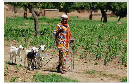
For smallholder farmers in many countries, such as this woman from Burkina Faso, goats are important livestock.