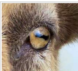
Eye with horizontal pupil

Goats are considered small livestock animals, compared to bigger animals such as cattle, camels and horses, but larger than microlivestock such as poultry, rabbits, caviae, and bees. Each recognized breed of goats has specific weight ranges, which vary from over 140 kg (300 lb) for bucks of larger breeds such as the Boer, to 20 to 27 kg (45 to 60 lb) for smaller goat does. [8] Within each breed, different strains or bloodlines may have different recognized sizes. At the bottom of the size range are miniature breeds such as the African Pygmy, which stand 41 to 58 cm (16 to 23 in) at the shoulder as adults. [9]