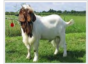
The Boer goat – in this case a buck – is a widely kept meat breed.