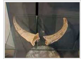
Horn cores from the Neolithic village of Atlit Yam

Goats are ruminants. They have a four-chambered stomach consisting of the rumen, the reticulum, the omasum, and the abomasum. As with other mammal ruminants, they are even-toed ungulates. The females have an udder consisting of two teats, in contrast to cattle, which have four teats. [12] An exception to this is the Boer goat, which sometimes may have up to eight teats. [13][14][15]