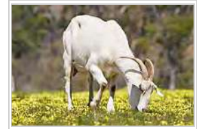
A domestic goat feeding in a field of capeweed, a weed which is toxic to most stock animals

A study by Queen Mary University reports that goats try to communicate with people in the same manner as domesticated animals such as dogs and horses. Goats were first domesticated as livestock more than 10,000 years ago. Research conducted to test communication skills found that the goats will look to a human for assistance when faced with a challenge that had previously been mastered,