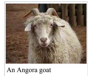
An Angora goat