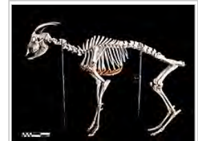
Skeleton ( Capra hircus )