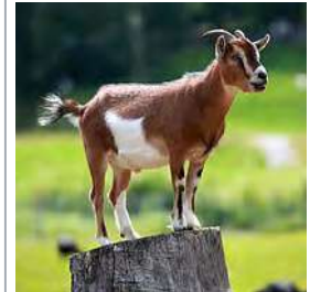
A pygmy goat on a stump.