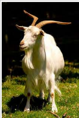
A white Irish goat with horns