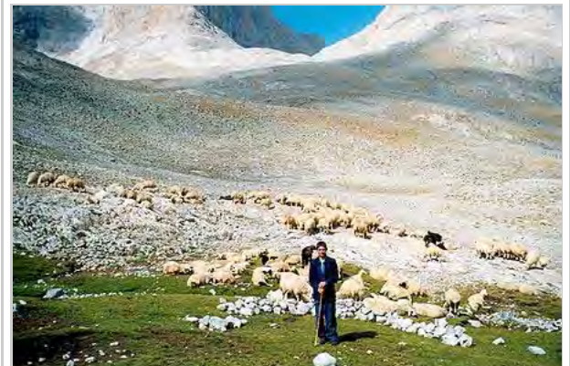
Yörük shepherd in the Taurus Mountains