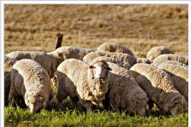
Australian Merino Sheep

In 2013, the five countries with the largest number of heads of sheep were mainland China (175 million), Australia (75.5 million), India (53.8 million), the former Sudan (52.5 million), and Iran (50.2 million). In 2013, the number of heads of sheep were distributed as follows: 44% in Asia, 28.2% in Africa; 11.2% in Europe,