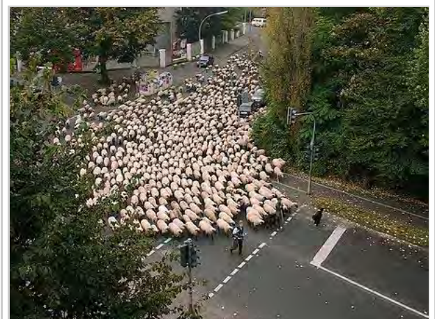
Flock of sheep moving through Cologne, Germany early on a holiday morning