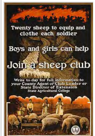
A World War I-era poster sponsored by the USDA encouraging children to raise sheep to provide needed war supplies.