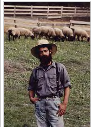
A shepherd tends his flock in Northern California.