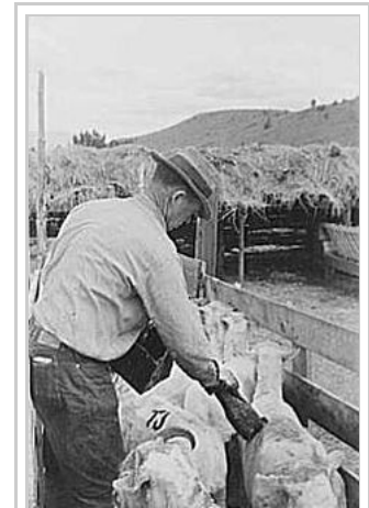
Branding sheep after shearing