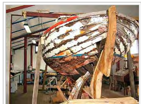
Damaged boat mid-reconstruction; carvel planking partially removed.

The traditional boat building material used for hull and spar construction. It is buoyant, widely available and easily worked. It is a popular material for small boats (of e.g. 6-metre (20 ft) length; such as dinghies and sailboats). Its abrasion resistance varies according to the hardness and density of the wood and it can deteriorate if fresh water or marine organisms are allowed to penetrate the wood. Woods such as Teak, Totara and some cedars have natural chemicals which prevent rot whereas other woods, such as Pinus radiata , will rot very quickly. The hull of a wooden boat usually consists of planking fastened to frames and a keel. Keel and frames are traditionally made of hardwoods such as oak while planking can be oak but is more often softwood such as pine, larch or cedar.