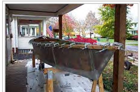
A sheet plywood sailboat during construction.