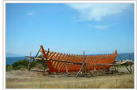
Side view of the wooden frame.