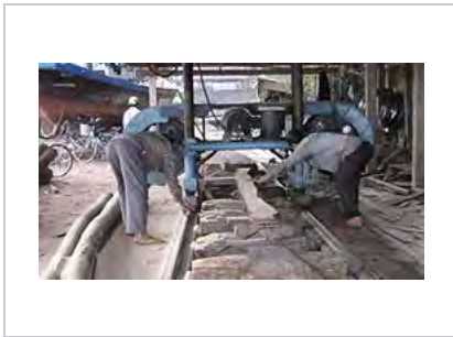
Small boatyard horizontal band saw, Hoi An.

Traditional wooden boat building in Vietnam. Photos taken January 2009.