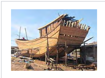
Almost completed offshore fishing hull, Quy Nhon.