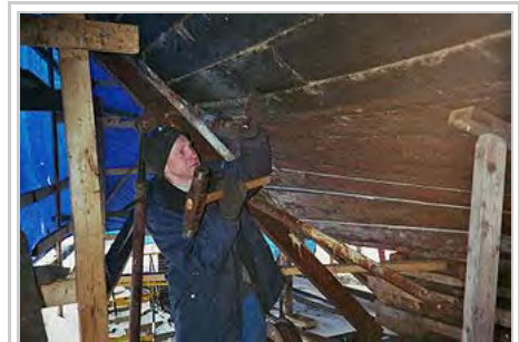
Caulking a wooden boat.