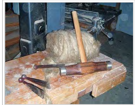
Caulking irons and oakum.