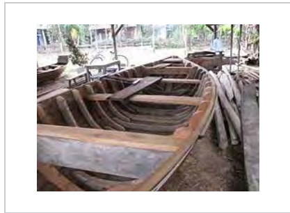
Boat nearing completion with frames added. Hoi An.