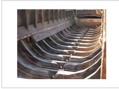
Repaired frames, barge hull. Sa Dec, Mekong Delta.