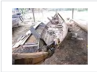
Small boat using the planks first method. Hoi An.