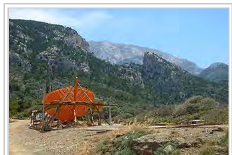
Boat building in Greece (Hellas).