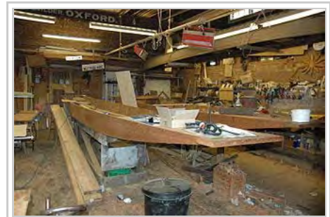
A punt under construction.