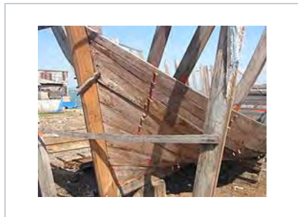
Plank fixing, trenails and red lead paint, Quy Nhon.