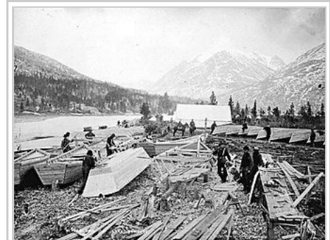
Wooden boats being built during the Klondike Gold Rush.