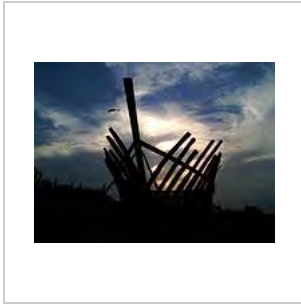
View of a Boat at Bheemunipatnam (being manufactured)

Traditional wooden boat building in Vietnam. Photos taken January 2009.