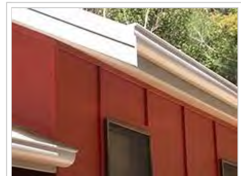
Detail - timber battens on fiber cement cladding, dwelling addition, Hardys Bay, NSW, Australia

Ludwig Hatschek patented fiber cement in Austria in 1901 and named it "Eternit" based on the Latin term "aeternitas" meaning everlasting. In 1903 the company Schweizerische Eternit-Werke AG began fabricating the material in the city of Niederurnen in Switzerland. Early fiber cement panels used asbestos fibers to add strength. Fiber cement products came about as a replacement for the widely used "asbestos cement sheeting" or "fibro", manufactured until the 1980s.