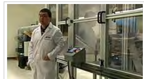
A video describing the dust hazards created by cutting fiber cement siding and an inexpensive way to reduce dust exposure.

As mentioned previously, long-term exposure to silica dust generated by cutting fiber cement siding during installation can lead to silicosis and other lung diseases among workers. [3] Researchers at the National Institute for Occupational Safety and Health (NIOSH) confirmed these findings, showing that many of the silica dust particles are in the respirable fraction, able to penetrate the deepest parts of the lung. [4] Laboratory tests performed by cutting fiber cement siding within an isolated chamber showed that by connecting a regular shop vacuum to a circular saw, exposures to silica dust produced by the cutting can be reduced by 80-90%. [5] Later, NIOSH completed four field surveys where construction workers cut fiber cement siding. Results showed that exposure to silica dust was controlled below the NIOSH Recommended Exposure Limit (REL) for respirable crystalline silica (0.05 mg/m 3 ) when a regular shop vacuum was used. [6]