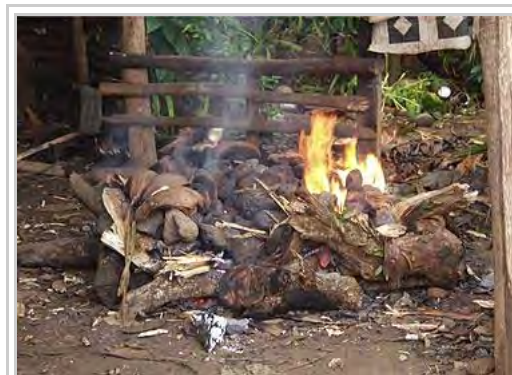
A Samoan 'umu at the early stage of heating the rocks

Today, many communities still use cooking pits for ceremonial or celebratory occasions, including the indigenous Fijian lovo , the Hawaiian luau , the Māori hāngi and the New England clam bake. The central Asian tandoor use the method primarily for uncovered, live-fire baking, which is a transitional design between the earth oven and the horizontal-plan masonry oven. This method is essentially a permanent earth oven made out of clay or firebrick with a constantly burning, very hot fire in the bottom. In modern times, earth ovens are sometimes used for outdoor cooking and recreational meals in lieu of an open campfire.