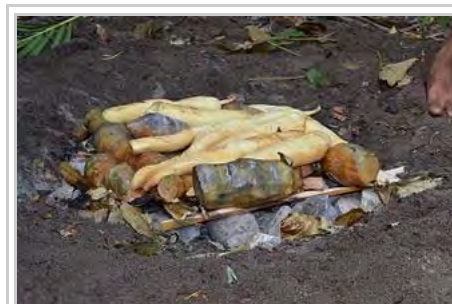
Fijian lovo of cooked staples