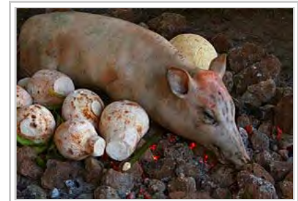
Samoan umu preparation with pig and taro on hot rocks above ground, later covered by leaves for cooking.

The Samoan umu starts with a fire to heat rocks which have been tested by fire as to whether they will explode upon heating. These rocks are used repeatedly but eventually are discarded and replaced when it is felt that they no longer hold enough heat. Once the rocks are hot enough, they are stacked around the parcels of food which are wrapped in banana leaves or aluminium foil. Leaves are then placed over the assembly and the food is left to cook for a few hours until it is fully cooked.