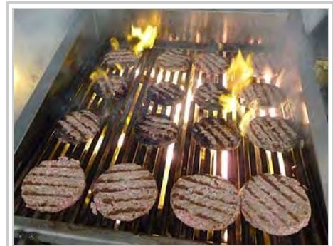
Hamburgers cooking on a charbroiler