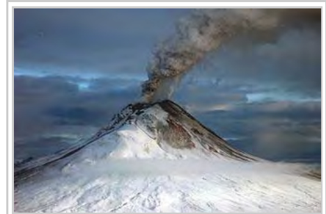
Volcanic gases entering the atmosphere with dust and tephra during eruption of volcano Augustine, 2006.

Substances that may become gaseous or give off gases when heated are termed volatile substances.