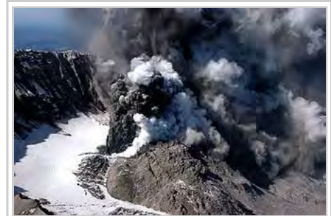
Eruption of Mount St. Helens