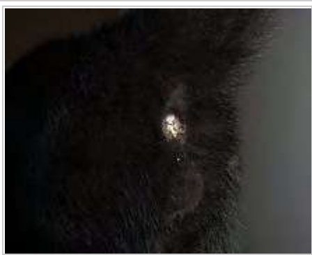
Image of a tapeworm proglottid leaving its definitive host

True tapeworms are exclusively hermaphrodites; they have both male and female reproductive systems in their bodies. The reproductive system includes one or more testes, cirri, vas deferens, and seminal vesicles as male organs, and a single lobed or unlobed ovary with the connecting oviduct and uterus as female organs. The common external opening for both male and female reproductive systems is known as the genital pore, which is situated at the surface opening of the cup-shaped atrium. [12][13] Though they are sexually hermaphroditic, self-fertilization is a rare phenomenon. To permit hybridization, cross-fertilization between two individuals is often practiced for reproduction. During copulation, the cirri of one individual connect with those of the other through the genital pore, and then spermatozoa are