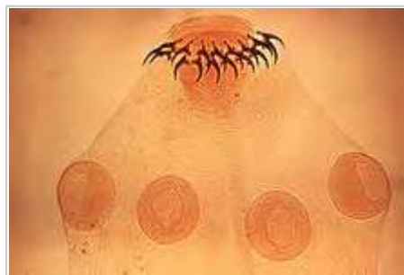
Scolex of Taenia solium with hooks and suckers.

The worm's scolex ("head") attaches to the intestine of the definitive host. In some species, the scolex is dominated by bothria, or "sucking grooves" that function like suction cups. Other species have hooks and suckers that aid in attachment. Cyclophyllid cestodes can be identified by the presence of four suckers on their scolices. [7]