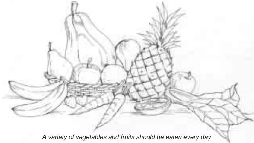
A variety of vegetables and fruits should be eaten every day

Food based sources of vitamins and minerals are the best choice. The use of multivitamins is recommended over the use of taking an individual micronutrient, because excesses of some single micronutrients can be harmful. Multivitamins are not a “ magic bullet ”, in that they should not replace healthful food choices. Fortified/enriched foods, cereals and grains, where available and affordable, are also a good source of some essential vitamins and minerals and can be incorporated as part of a nutritious diet.