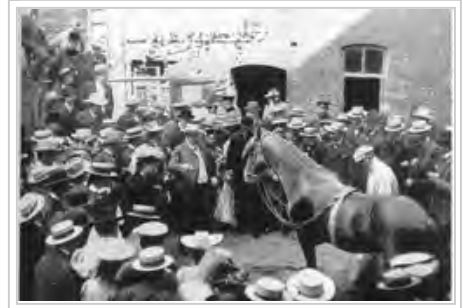
"Clever Hans", an Orlov Trotter horse that was claimed to have been able to perform arithmetic and other intellectual tasks.