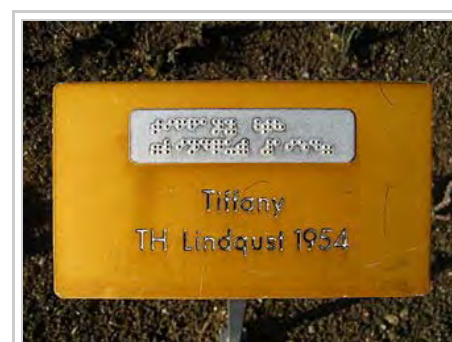
Braille plate at Duftrosengarten in Rapperswil, Switzerland

When braille was first adapted to languages other than French, many schemes were adopted, including mapping the native alphabet to the alphabetical order of French – e.g. in English W , which was not in the French alphabet at the time, is mapped to braille X , X to Y , Y to Z , and Z to the first French accented letter – or completely rearranging the alphabet such that common letters are represented by the simplest braille patterns. Consequently, mutual intelligibility was greatly hindered by this state of affairs. In 1878, the International Congress on Work for the Blind, held in Paris, proposed an international braille standard, where braille codes for different languages and scripts would be based, not on the order of a particular alphabet, but on phonetic correspondence and transliteration to Latin. [25]