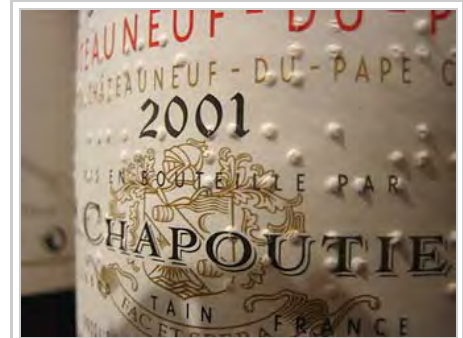
A bottle of Chapoutier wine, with braille on the label

The Unicode block for braille is U+2800 ... U+28FF: