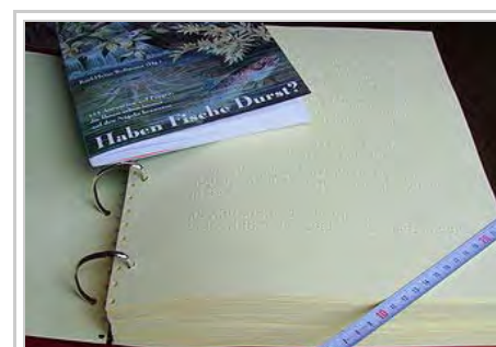
Braille book and the same book in standard inkprint