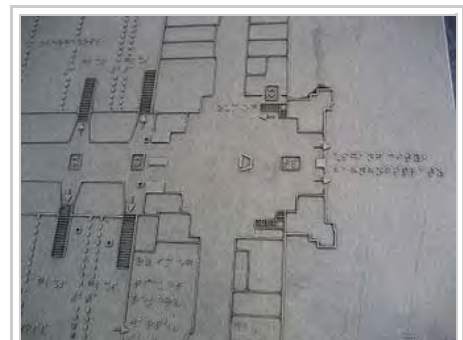
An embossed map of a German train station, with braille text