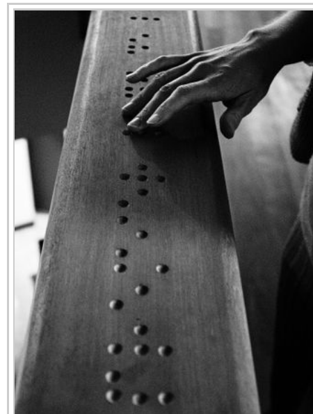
The Braille code where the word ⠠ ⠡ ⠣ ⠤ ⠥ ⠦ ⠧ ⠨ ⠩ ⠪ ⠬ ⠭ ⠮ ⠯ ⠰ ⠱ ⠲ ⠳ ⠴ ⠵ ⠶ ⠷ ⠸ ⠹ ⠺ ⠻ ⠼ ⠽ ⠾ ⠿ (premier, French for "first") can be read.

The a–j series lowered by one dot space (⠠ ⠡ ⠣ ⠤ ⠥ ⠦ ⠧ ⠨ ⠩ ⠪ ⠬ ⠭ ⠮ ⠯ ⠰ ⠱ ⠲ ⠳ ⠴ ⠵ ⠶ ⠷ ⠸ ⠹ ⠺ ⠻ ⠼ ⠽ ⠾ ⠿) are used for punctuation. Letters a ⠠ and c ⠡, which only use dots in the top row, were lowered two places for the apostrophe and hyphen: ⠠ ⠡. (These are the decade diacritics, at left in the table below, of the second and third decade.)