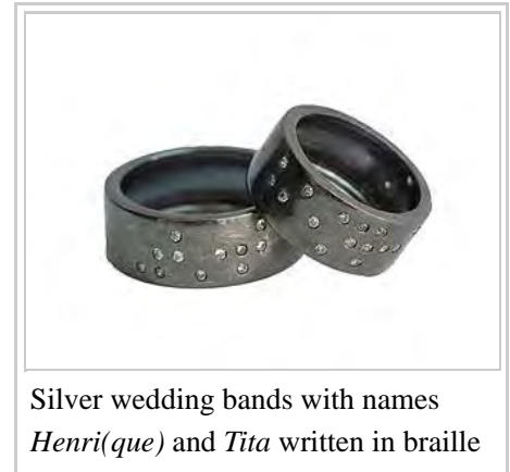
Silver wedding bands with names Henri(que) and Tita written in braille

Braille has been extended to an 8-dot code, particularly for use with braille embossers and refreshable braille displays. In 8-dot braille the additional dots are added at the bottom of the cell, giving a matrix 4 dots high by 2 dots wide. The additional dots are given the numbers 7 (for the lower-left dot) and 8 (for the lower-right dot).