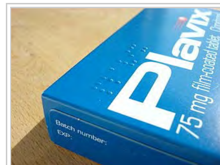
Braille on a box of tablets. The raised Braille reads 'P L A V I X'.