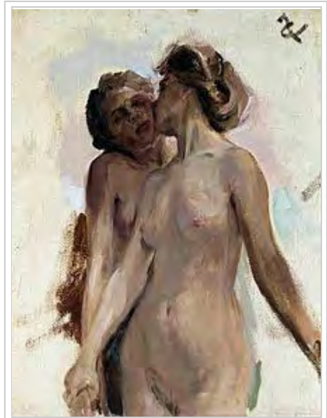
Symbolic dance by Jan Ciągliński, late 19th-century subtle lesbian erotica (National Museum in Warsaw).

Audre Lorde, a Caribbean-American writer and out-spoken feminist talks of the erotic being a type of power being specific to females. "There are many kinds of power [...] The erotic is a resource within each of us that lies in a deeply female and spiritual plane, firmly rooted in the power of our unexpressed or unrecognized feelings". [33] In "The Uses of the Erotic" within Sister Outsider , she discusses how erotic comes from sharing, but if we suppress the erotic rather than recognize its presence, it takes on a different form. Rather than enjoying and sharing with one another, it is objectifying, which she says translates into abuse as we attempt to hide and suppress our experiences. [34]