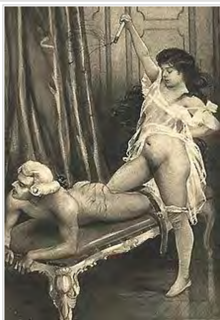
An erotic scene from Fanny Hill by French illustrator Édouard-Henri Avril

For a psychoanalytical definition, as early as Freud [14] psychotherapists have turned to the ancient Greek philosophy's "overturning of mythology" as a definition to understanding of the heightened aesthetic. [15] For Plato, Eros takes an almost transcendent manifestation when the subject seeks to go beyond itself and form a communion with the objectival other: "the true order of going...to the things of love, is to use the beauties of earth as steps...to all fair forms, and from fair forms to fair actions, and from fair actions to fair notions, until from fair notions he arrives at the notion of absolute beauty". [16]