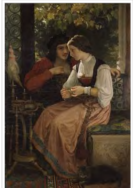
"The Proposal" by William-Adolphe Bouguereau.