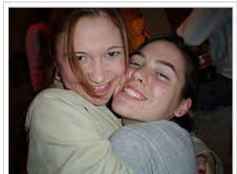
Women sharing physical intimacy

Most people value their personal space and feel discomfort, anger, or anxiety when somebody encroaches on their personal space without consent. [3] Entering somebody's personal space is normally an indication of familiarity and intimacy. However, in modern society, especially in crowded urban communities, it is at times difficult to maintain personal space, for example, in a crowded train, elevator or street. Many people find the physical proximity within crowded spaces to be psychologically disturbing and uncomfortable, [3] though it is accepted as a fact of modern life. In an impersonal crowded situation, eye contact tends to be avoided. Even in a crowded place, preserving personal space is important. Non-consensual intimate and sexual contact, such as frotteurism and groping, are unacceptable.