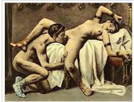
19th-century depiction of cunnilingus (detail) by Paul Avril