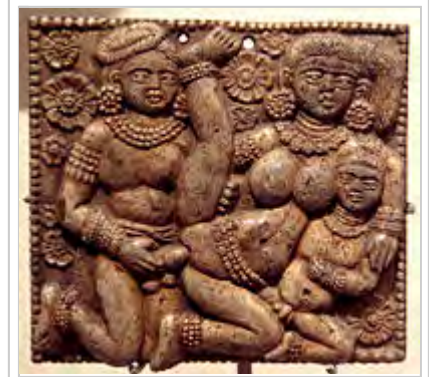
A love scene sculpture from the Sunga period (ca. 1st century BCE).

There are numerous sex positions that participants may adopt in any of these types of sexual intercourse or acts; some authors have argued that the number of sex positions is essentially limitless.