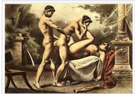
19th-century depiction of a "sandwich" by Paul Avril