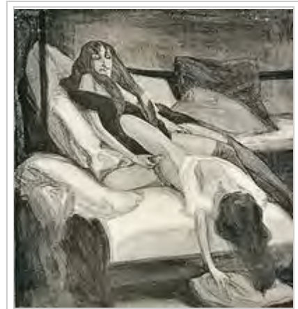
Drawing by Franz von Bayros showing an act of fingering

The slang term humping may refer to masturbation—thrusting one's genitals against the surface of non-sexual objects, clothed or unclothed; or it may refer to penetrative sex.