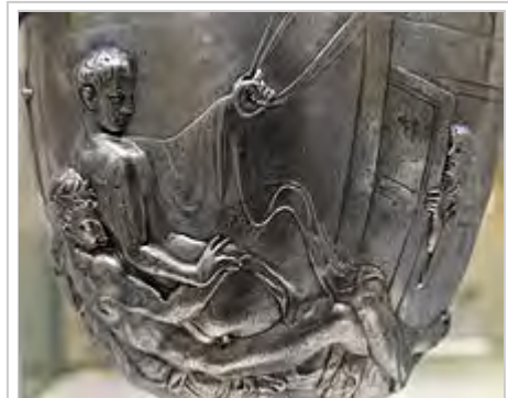
1st century AD depiction of 'spooning'

In the spoons position both partners lie on their side, facing the same direction. [11] Variants of this technique include the following: