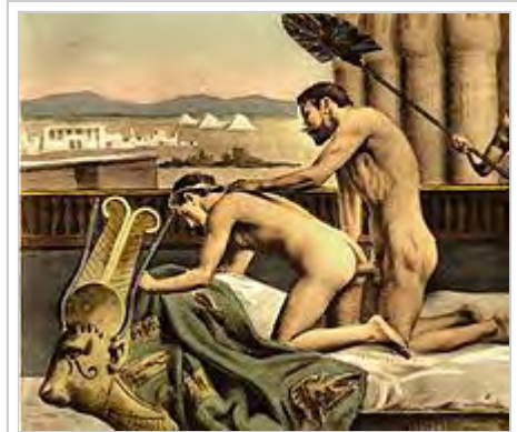
19th century depiction of anal penetration; detail of a painting by Paul Avril