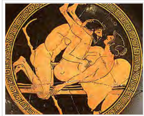
Tondo of an Attic red-figure kylix by the Triptolemos painter, ca. 470 BC, Tarquinia National Museum