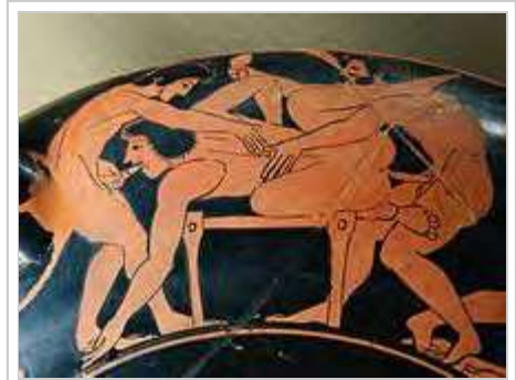
Depiction of a 'spit roast' on the rim of an Attic red-figure kylix, c. 510 BC