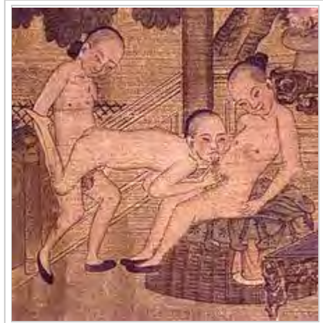
A late 19th-century Beijing hand scroll depicting fellatio