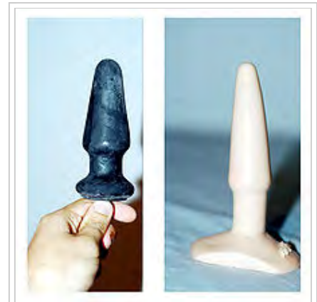
Two butt plugs