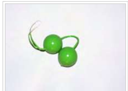
A type of Ben Wa balls