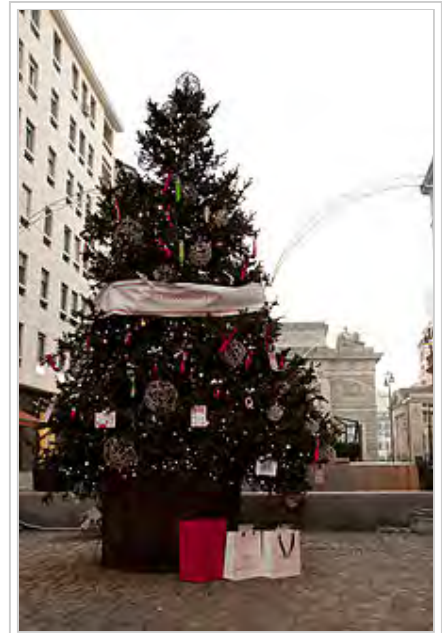
Christmas tree decorated with sex toys [1]