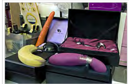
Collection of sex toys