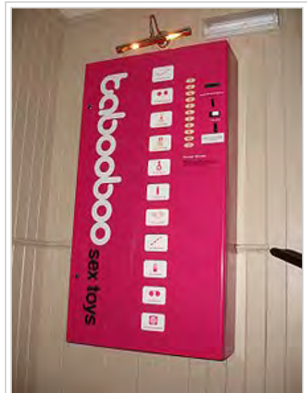
Vending machine selling a range of sex toys