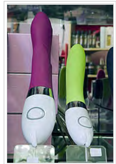
Two vibrators in a sex shop

A vibrator is a sex toy that is used on the body to produce pleasurable erotic stimulation. Most 2010-era vibrators contain an electric-powered device which pulsates or throbs, which is used to stimulate erogenous zones such as the clitoris, rest of the vulva or vagina, penis, scrotum or anus. There are many different shapes and models of vibrators. Some vibrators designed for women stimulate both the clitoris and the vagina. Some vibrators designed for couples stimulate the genitals of both partners.