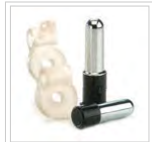
Vibrator for Couples: Love Ring