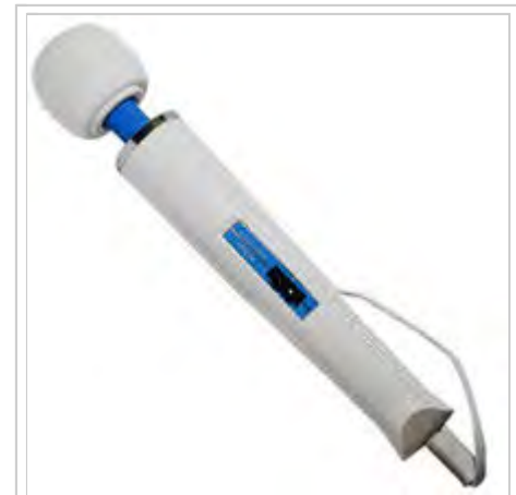
Hitachi Magic Wand