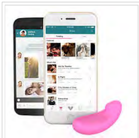
Remote control Vibrator