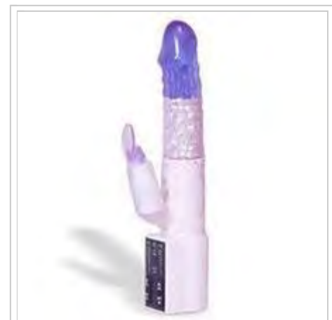
Techno Rabbit Vibrator