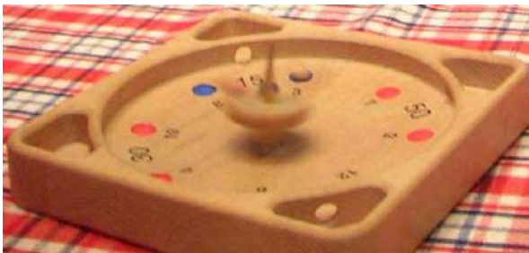
A bauernroulette game