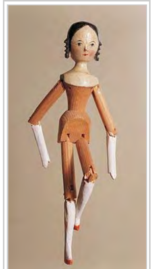
A peg wooden doll from Val Gardena, 1850