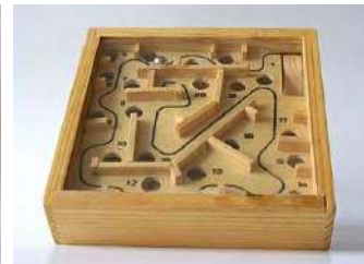
A puzzle of dexterity, a type of mechanical puzzle