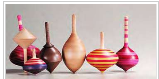
Various spinning tops