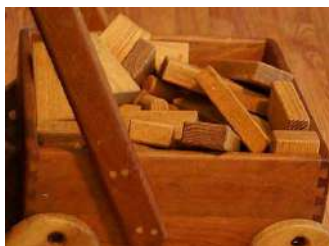
Wooden unit blocks, a type of toy block, in a wooden wagon