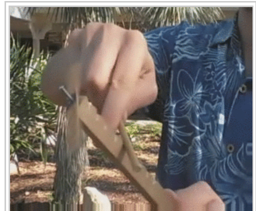
A gee-haw whammy diddle in use