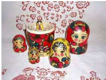
A matryoshka doll doll taken apart