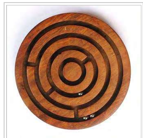
A ball-in-a-maze puzzle